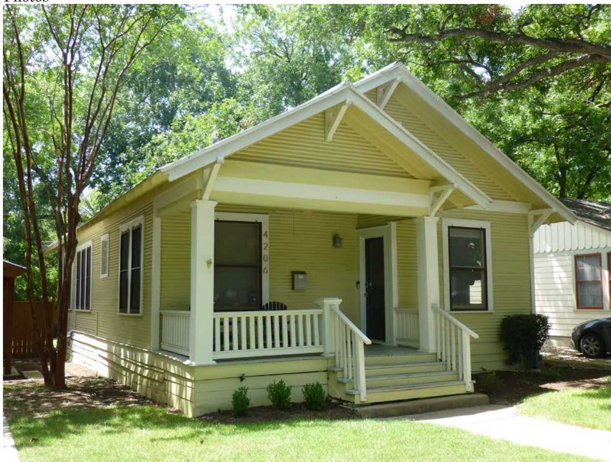
South elevation and primary (east) façade of 4206 Avenue B.