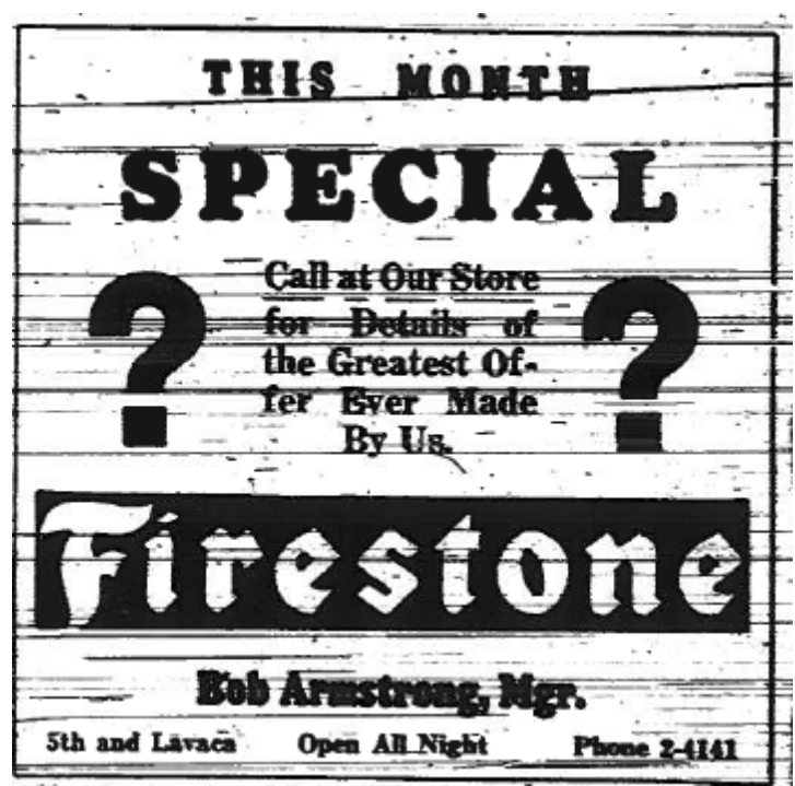
Advertisement for the Firestone store Austin American, March 9, 1936