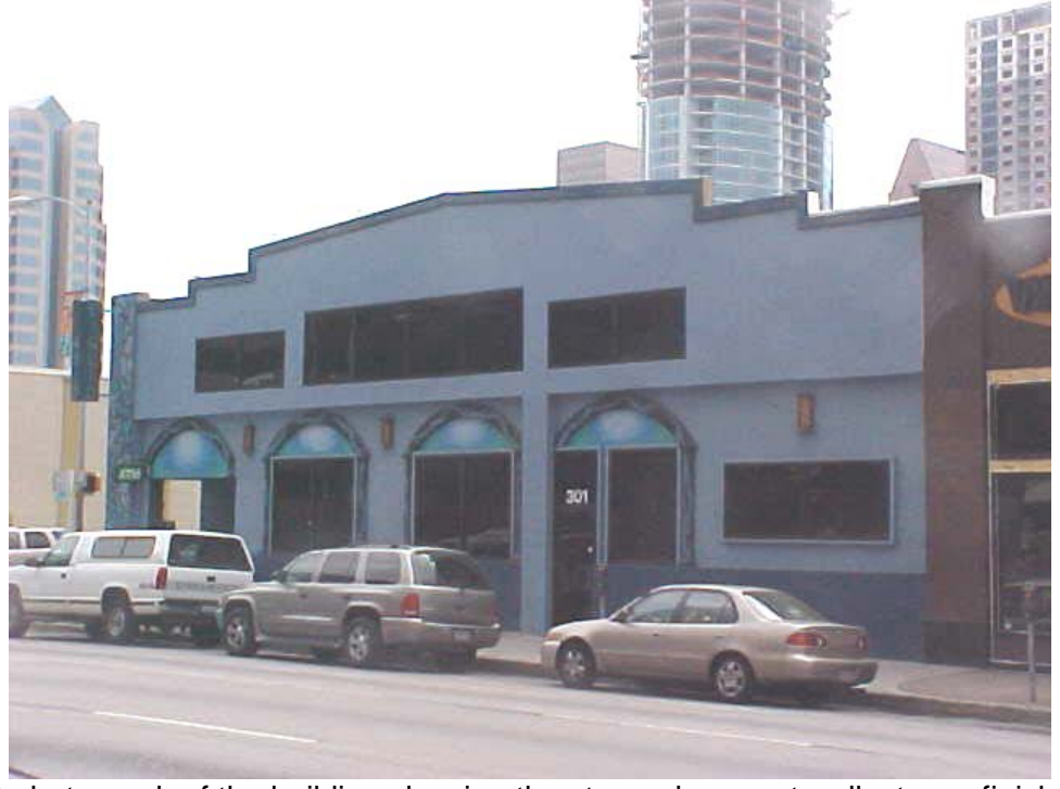
2008 photograph of the building showing the stepped parapet wall, stucco finish, and arched window openings