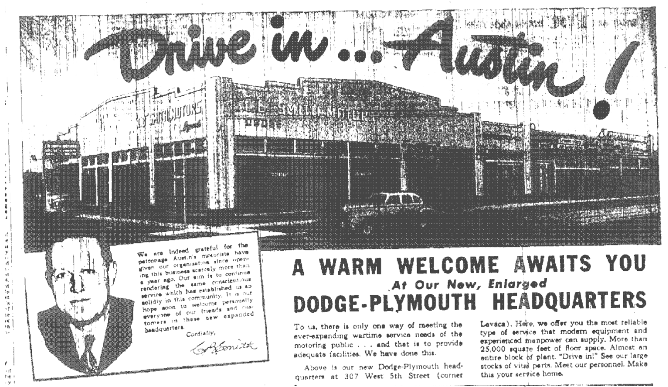
Ad for C.B. Smith Dodge and Plymouth dealership, 301-07 W. 5<sup>th</sup> Street Austin American-Statesman, January 14, 1945

The building in the foreground is 301 W. 5<sup>th</sup> Street at the corner of Lavaca Street after the 1944 renovations that filled in the original filling station openings with display windows. Although the original roofline remains, the showroom windows and transoms have been covered over with stuccoed arches and the windows have all been replaced. The ad also shows the south side of the 300 block of W. 5<sup>th</sup> Street to west 307, including what is now the Whiskey Bar at 303 W. 5<sup>th</sup> Street, the Rainbow Cattle Company at 305 W. 5<sup>th</sup> Street, and the former home of Hot Jumbo Bagel at 307 W. 5<sup>th</sup> Street.