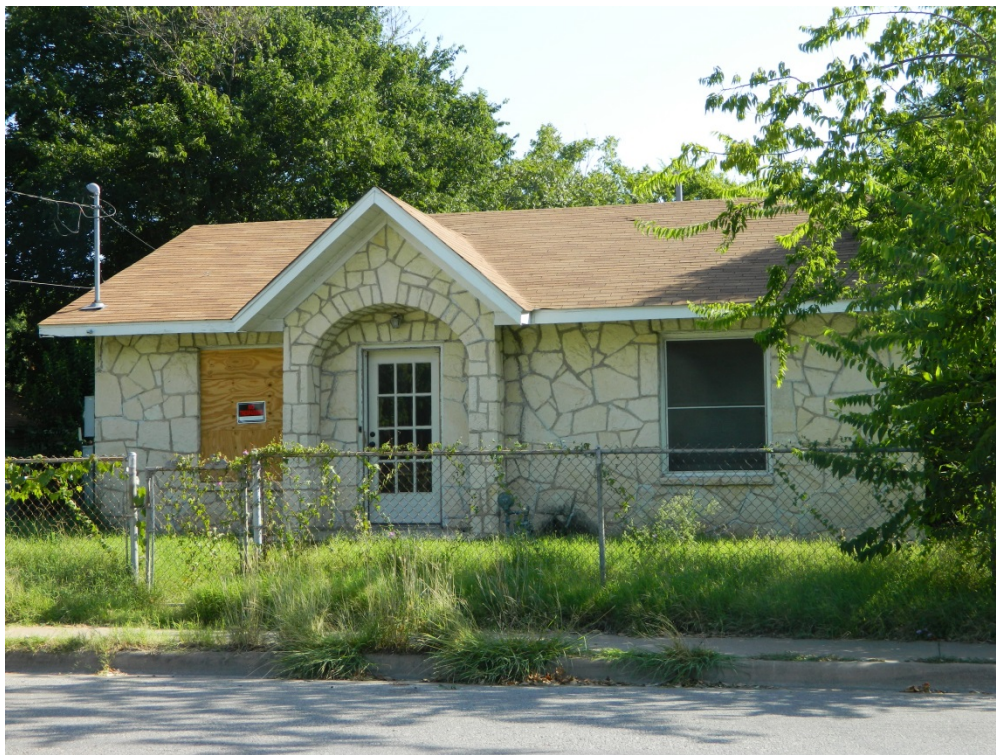
Photograph taken July, 2018