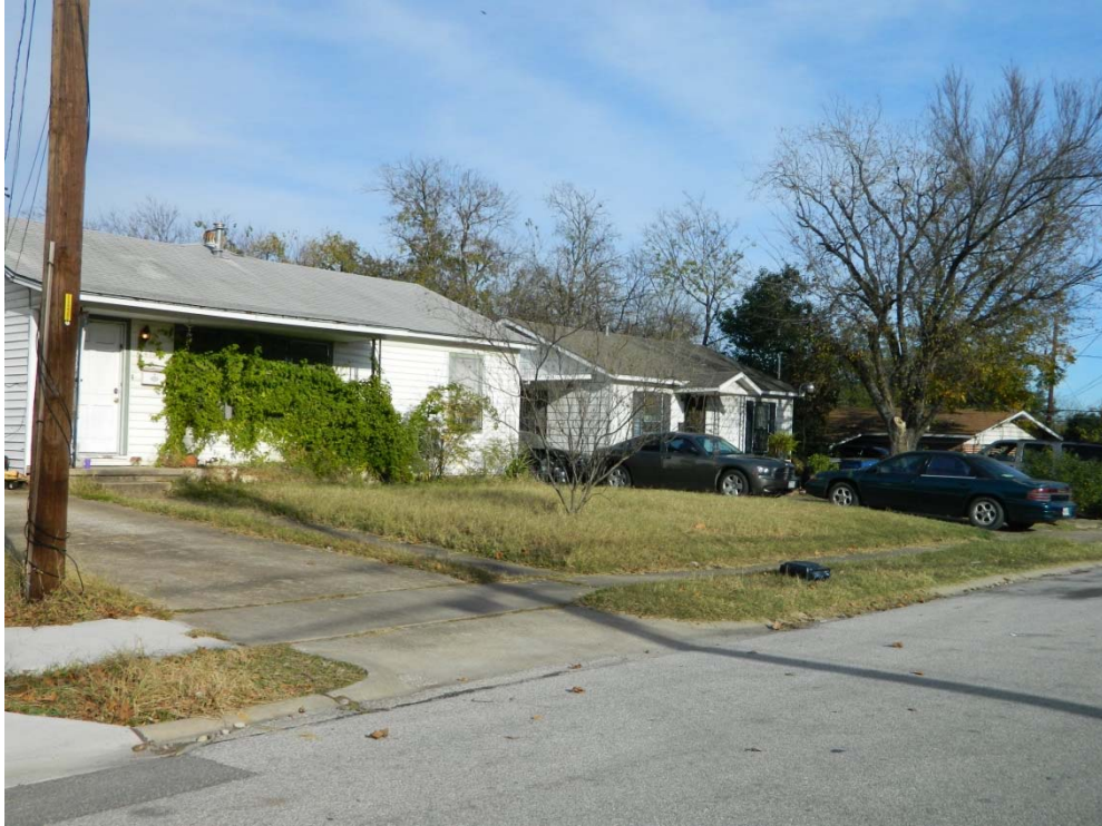
Representative views of the Cedar Valley subdivision (December, 2017)