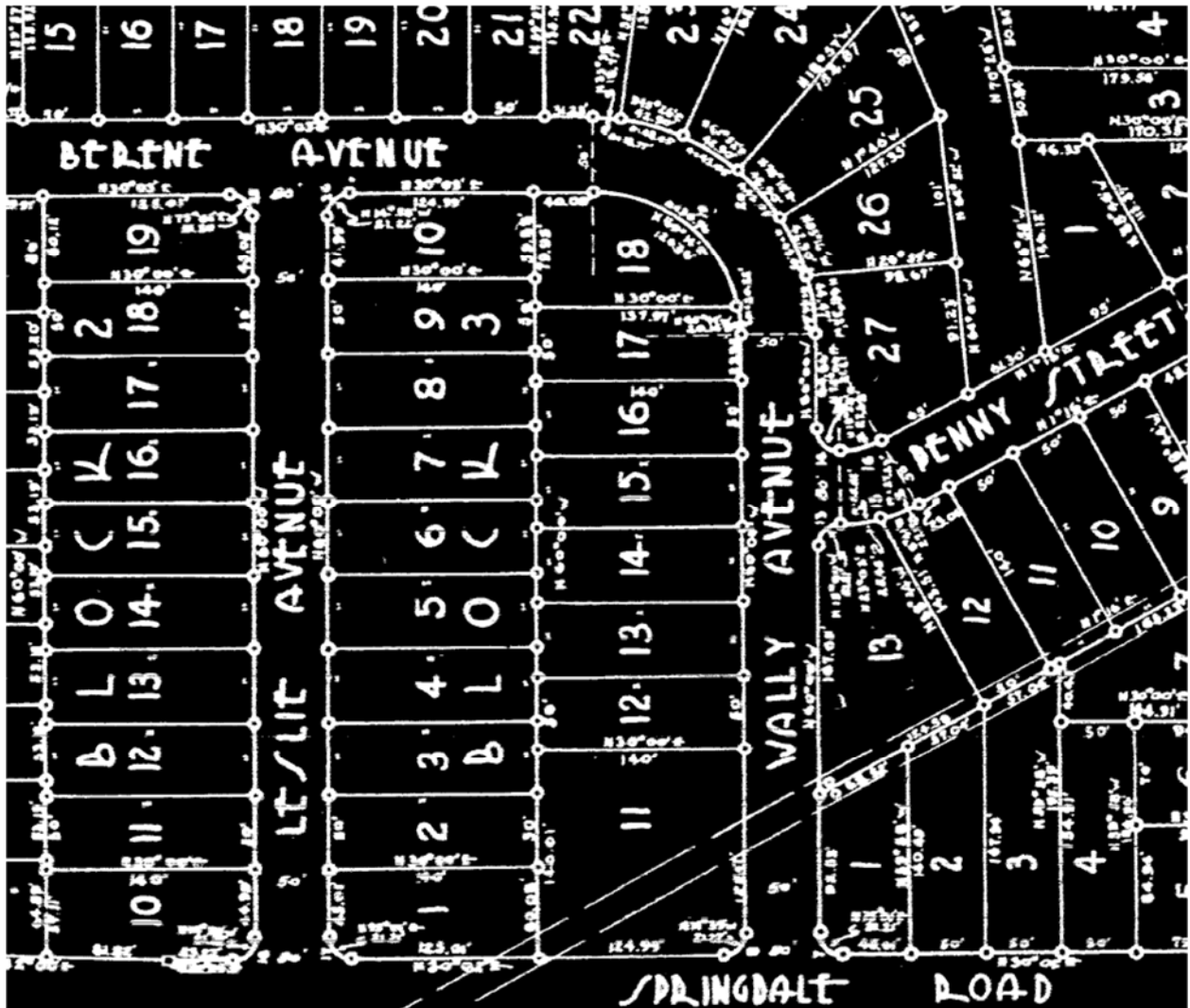
A section of the Cedar Valley plat