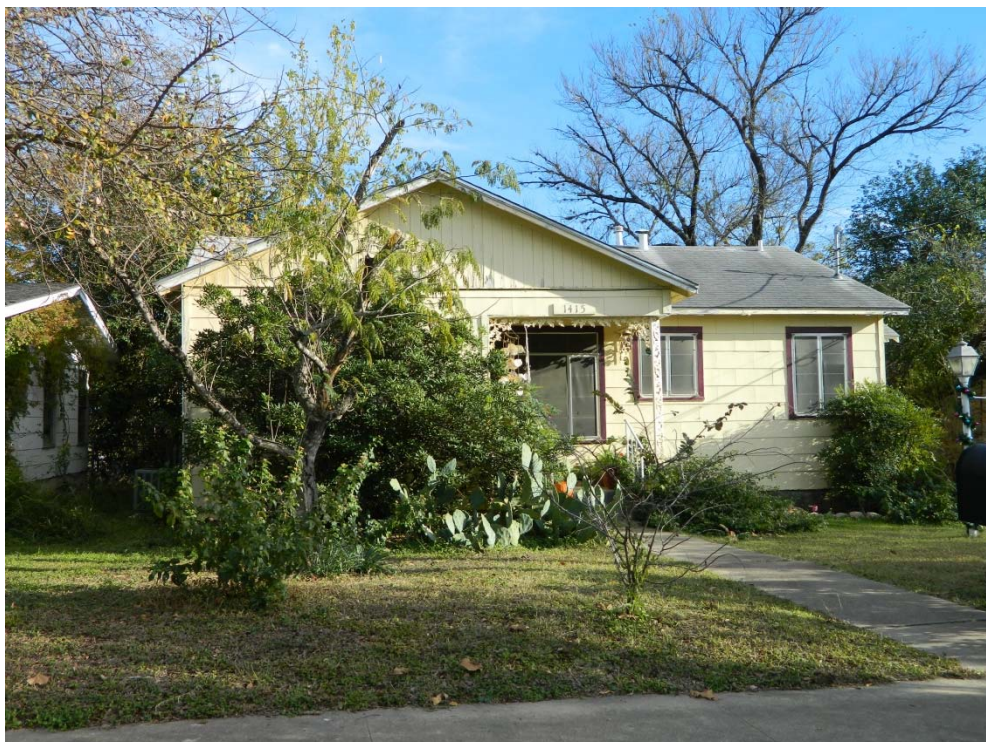
1415 Berene Street today (December, 2017)

A home in the Cedar Valley Subdivision featured in Austin Homes Beautiful Austin American-Statesman , September 14 1952