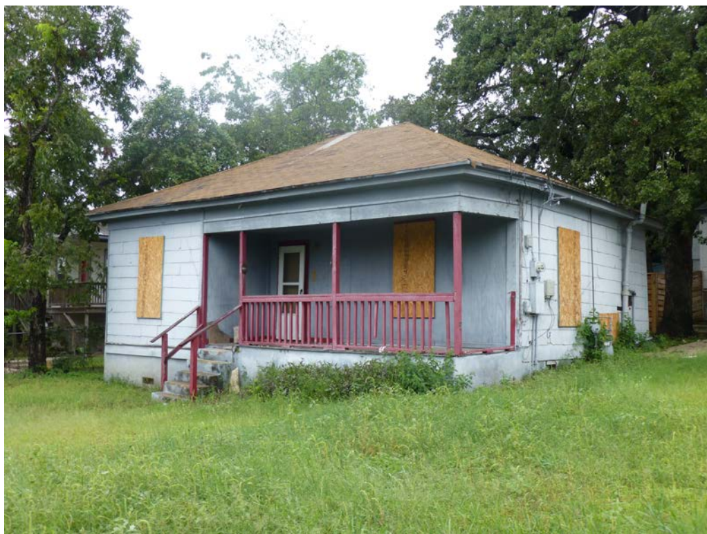
Primary (south) façade and east elevation of 1908 Pennsylvania Avenue.