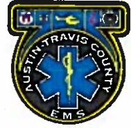
EMS Budgeted Overtime vs Actual Overtime 9/17/17 - 9/16/2018