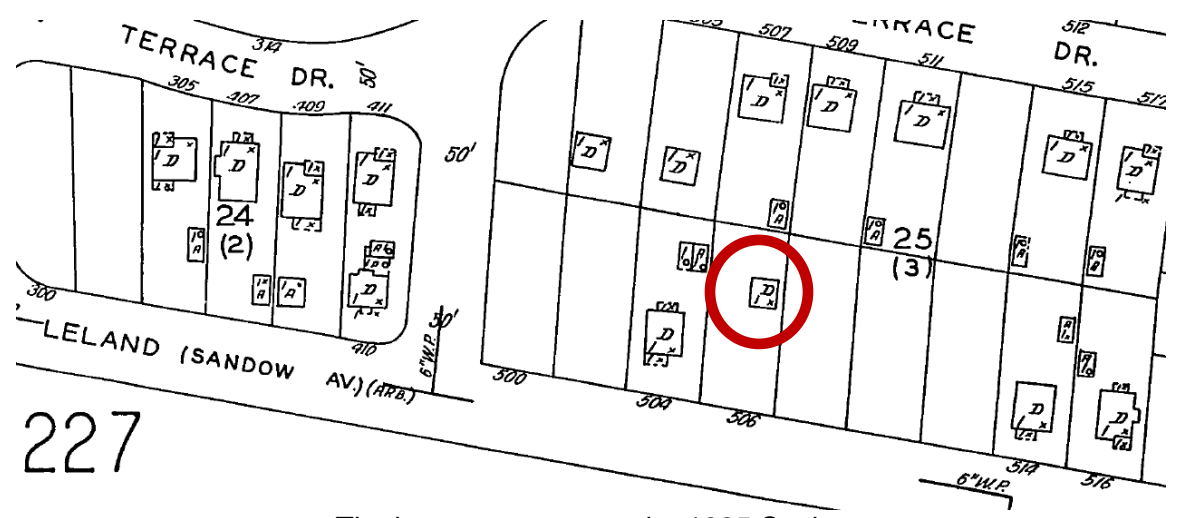
The house appears on the 1935 Sanborn map.