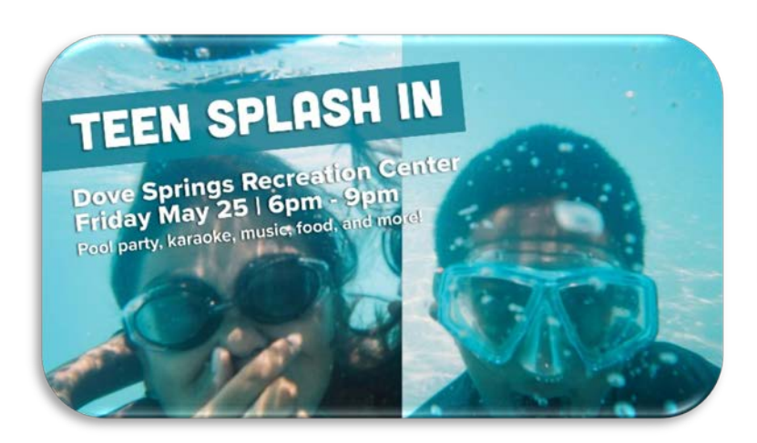
Teen Pool Parties