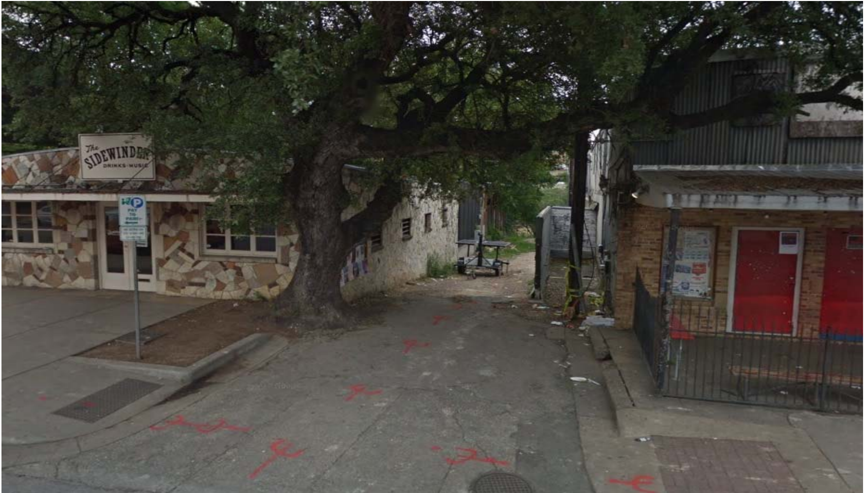
715 Red River: Currently Vacant