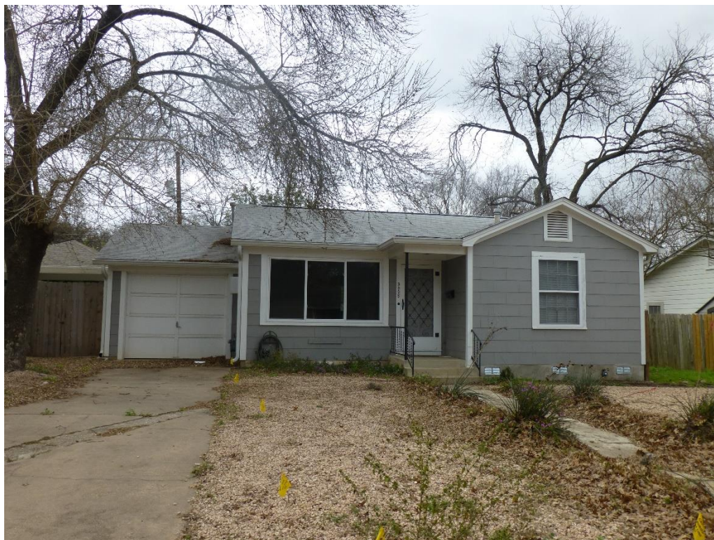
Primary (west) façade of 3005 Funston Street.