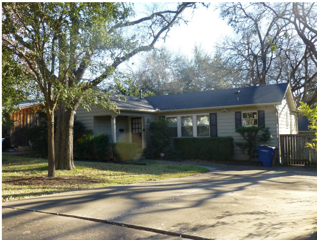
Primary (north) façade and east elevation of 1705 W. 30 th Street.