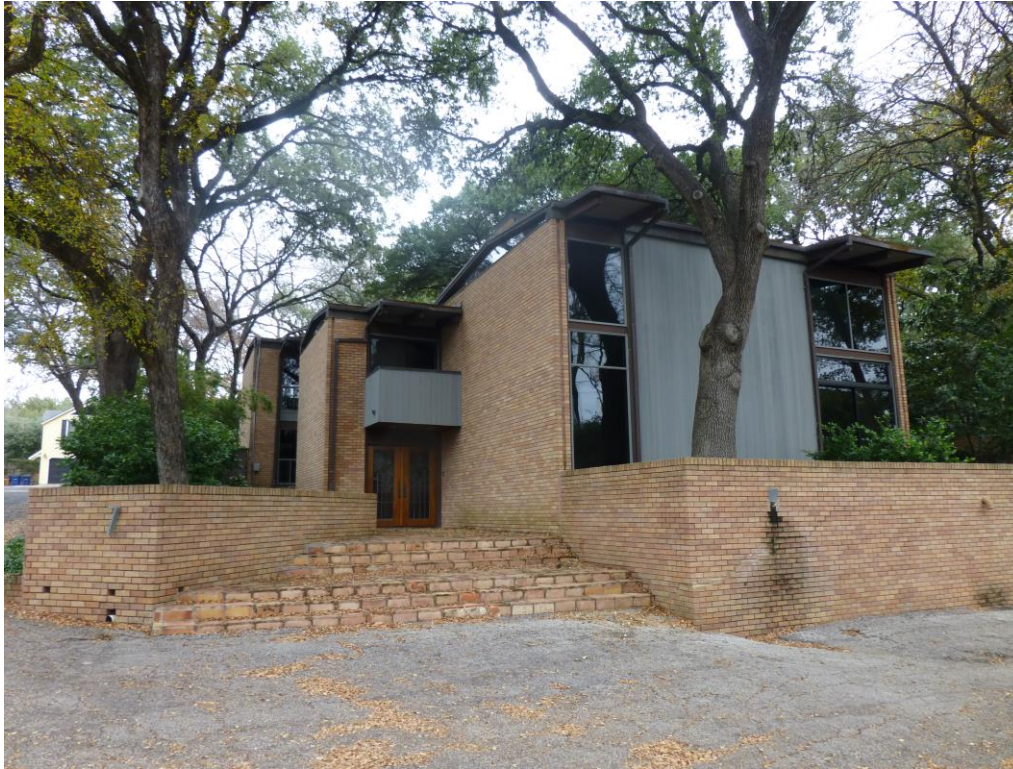
Primary (south) façade and west elevation of 7 Green Lanes.