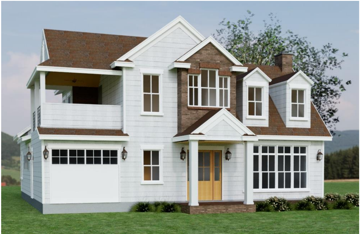
02-15-2019 – Committee recommendations implemented