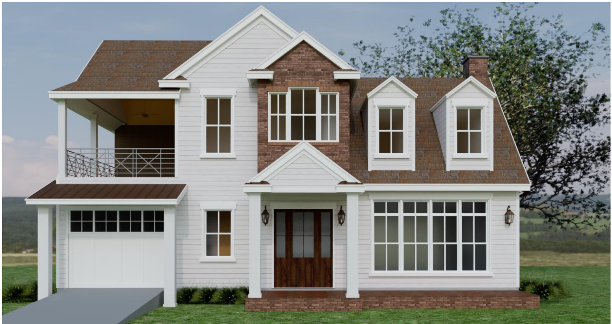
01-25-2019 – Original submittal