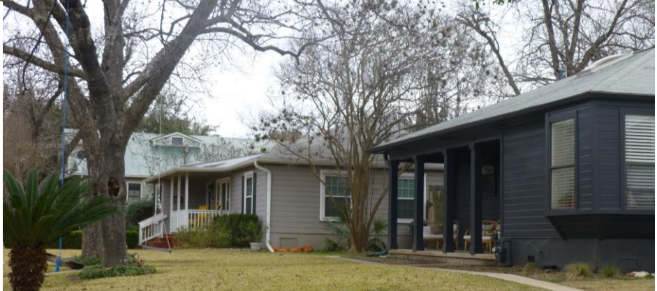
Views down Funston St.