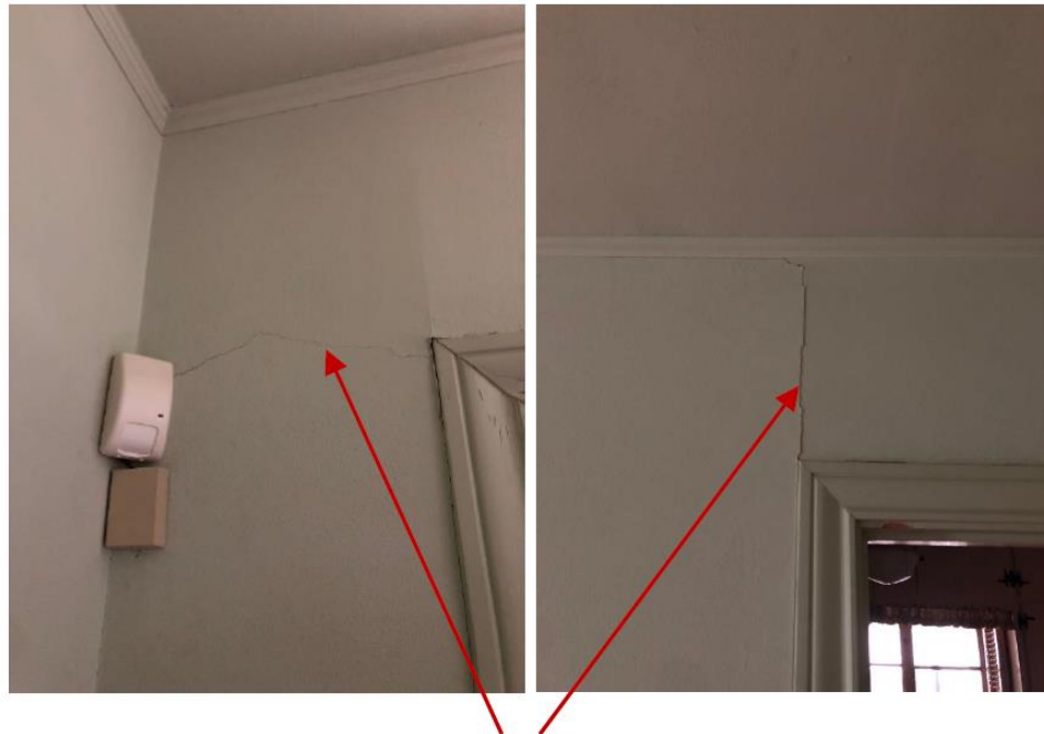
Multiple diagonal and vertical cracks noticed on walls at corner of windows/doors.