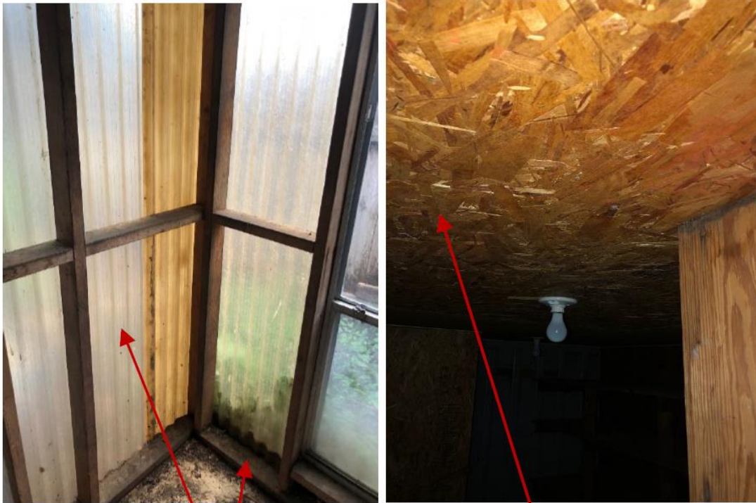
Framing deficiencies: improper sheathing/bracing; improper connection to foundation slab/flatwork