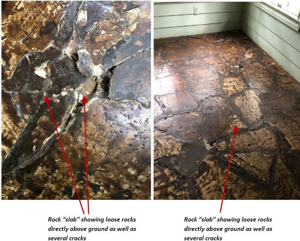
Figure 3: Site Drainage