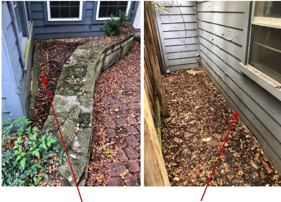
Inadequate drainage and walls limiting water runoff