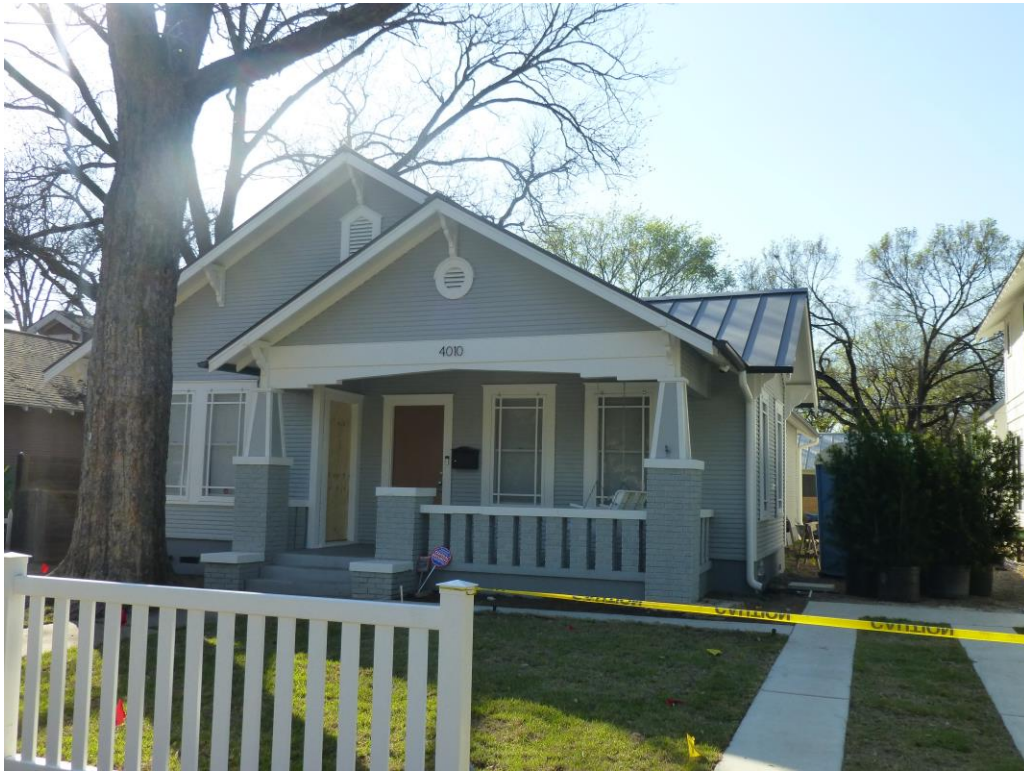
Primary (east) façade and south elevation of 4010 Avenue G. No changes are proposed to the main house.