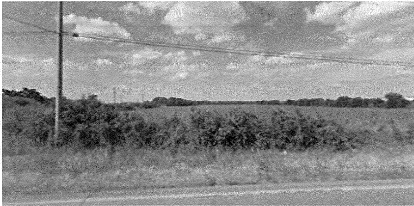
770 Farm to Market 1626