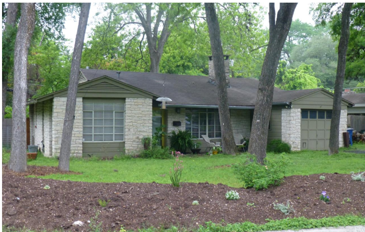
Contributing houses on the 1500 block of Wilshire Boulevard.