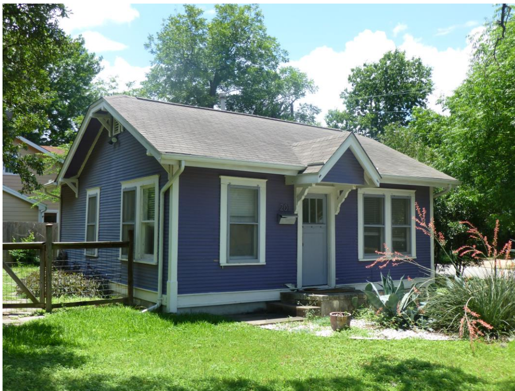
Primary (north) façade and east elevation of 201 Leland Street.