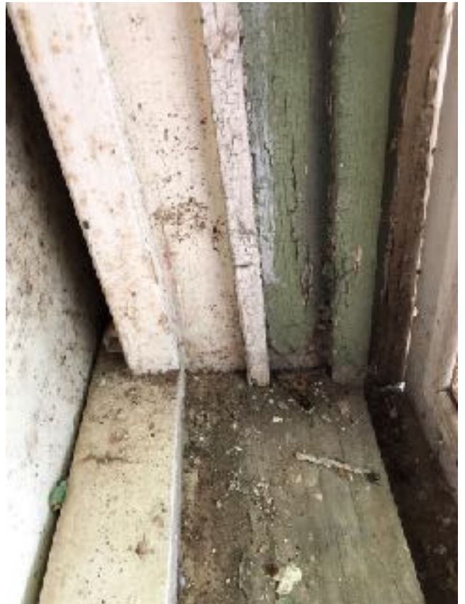
Image of window and door condition 1408 West 9th Street (this page). Evidence of Rot, Termite damage, and physical damage present. Replacement windows without weatherstripping causing further moisture damage at window frame.