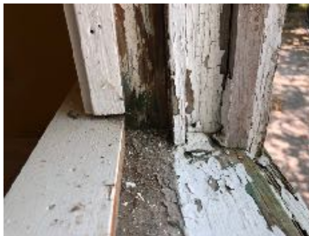
Image of window condition 1408 West 9th Street (this page). Evidence of Rot, Termite damage, and physical damage present.