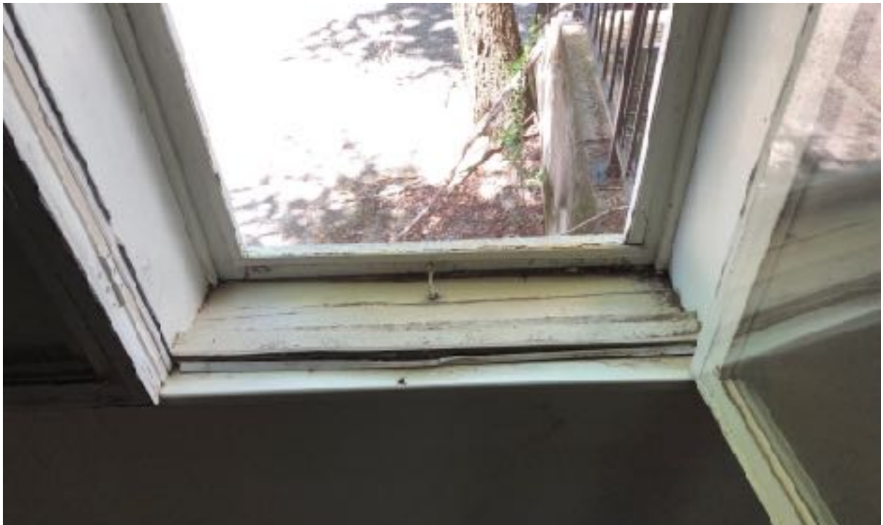
Image of window condition 1408 West 9th Street (this page). Evidence of Rot, Termite damage, and physical damage present. Damage to existing windows due to plexiglass reinforcement and lack of weatherstripping causing further moisture damage at window frame.