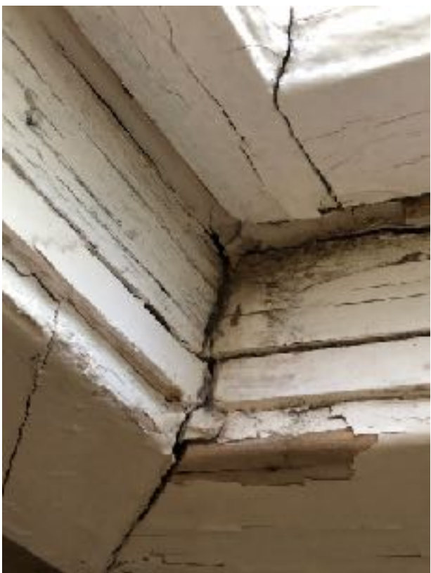
Image of window condition 1410 West 9th Street (this page). Evidence of Rot, Termite damage, and physical damage present.