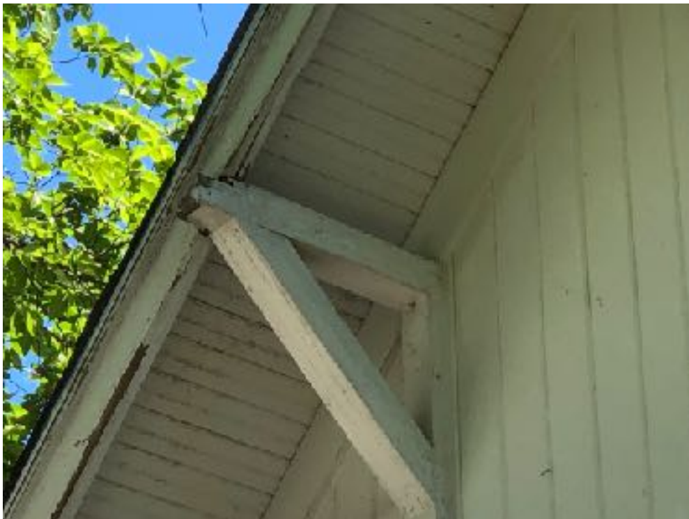
Image of exterior trim siding condition 1408 West 9th Street (this page). Evidence of Rot, Termite damage, and physical damage present. Damage to trim detailing. Repair/replacement in-kind proposed.