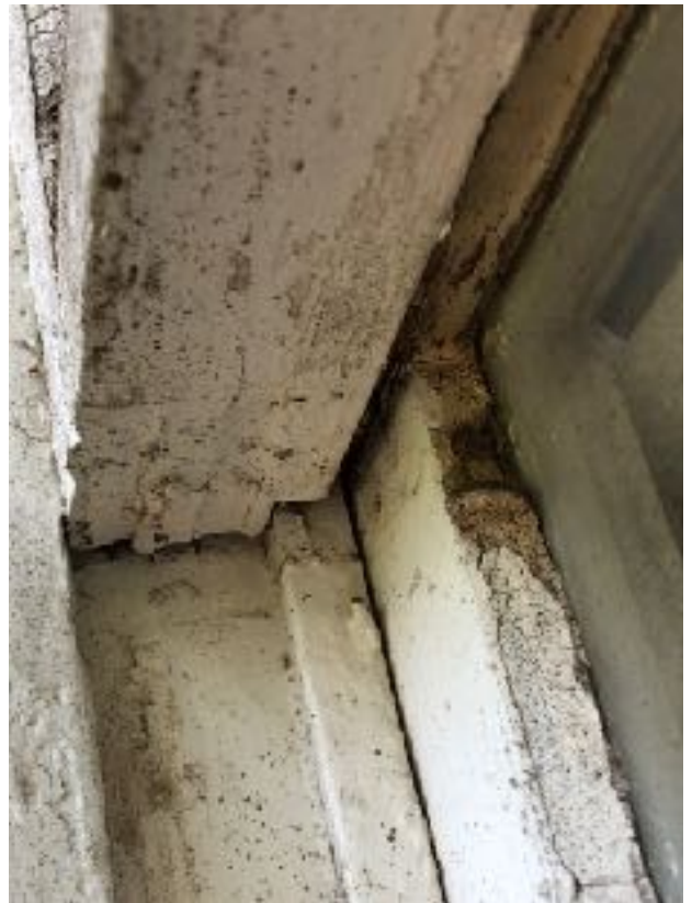
Image of window condition 1410 West 9th Street (this page). Evidence of Rot, Termite damage, and physical damage present.