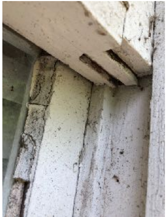
Image of window condition 1410 West 9th Street (this page). Evidence of Rot, Termite damage, and physical damage present.