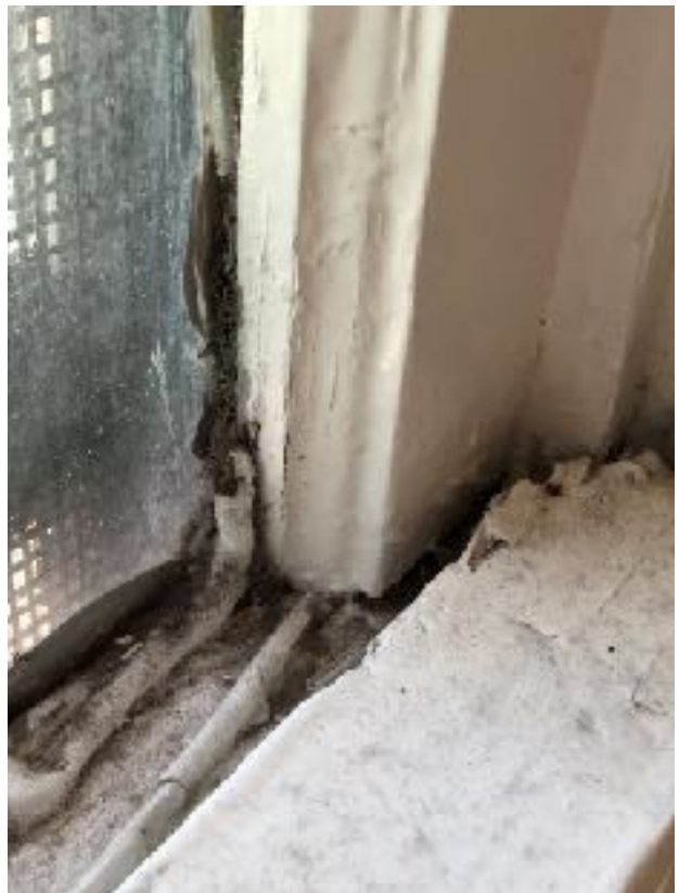
Image of window condition 1410 West 9th Street (this page). Evidence of Rot, Termite damage, and physical damage present.