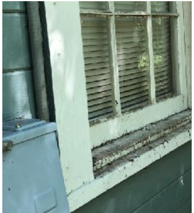
Image of window condition 1408 West 9th Street (this page). Evidence of Rot, Termite damage, and physical damage present. Damage to trim detailing. Repair/replacement in-kind proposed.