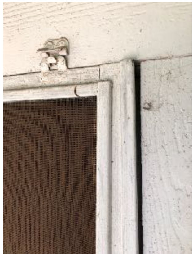
Image of window condition 1410 West 9th Street (this page). Evidence of Rot, Termite damage, and physical damage present.