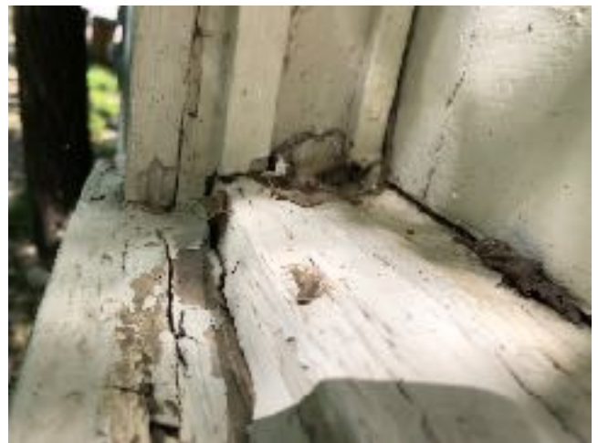
Image of window and siding condition 1408 West 9th Street (this page). Evidence of Rot, Termite damage, and physical damage present.