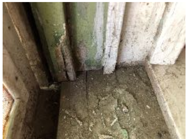
Image of window condition 1408 West 9th Street (this page). Evidence of Rot, Termite damage, and physical damage present. Damage to existing windows due to plexiglass reinforcement and lack of weatherstripping causing further moisture damage at window frame.