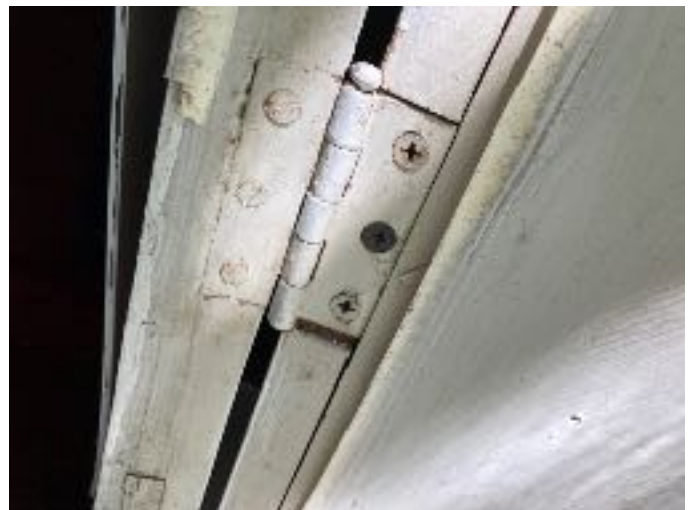
Image of window condition 1408 West 9th Street (this page). Evidence of Rot, Termite damage, and physical damage present. Damage to existing windows due to plexiglass reinforcement and lack of weatherstripping causing further moisture damage at window frame.