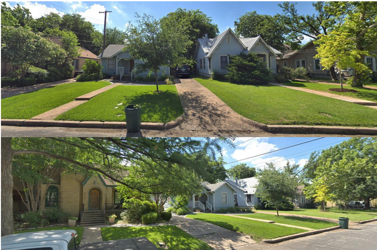
Streetscape and adjacent structures