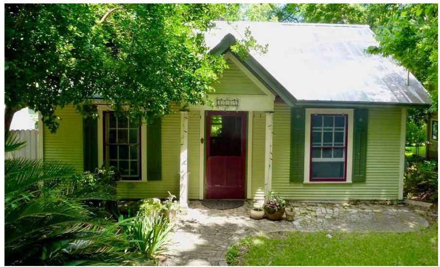
Main elevation, Zillow.com, 2019