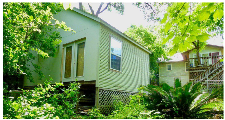
Rear elevation and accessory structure, Zillow.com, 2019