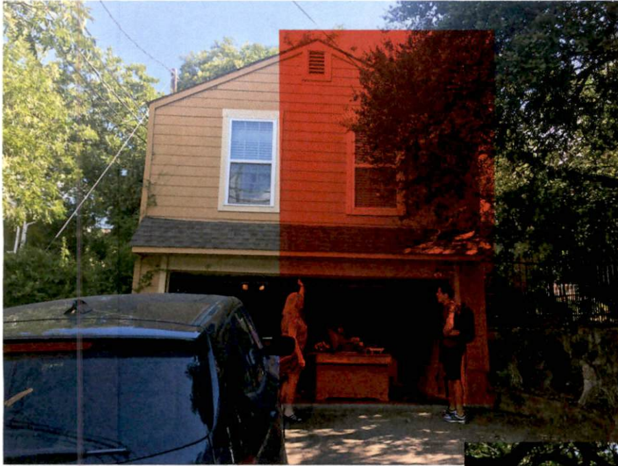
South elevation- addition will join here