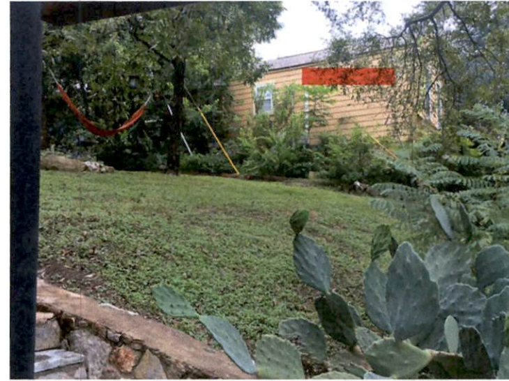
West side, non-conforming. Only minor window adjustments