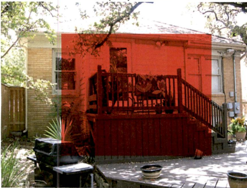
rear (west) elevation-change shed to open porch, remove wood deck