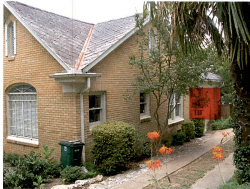
north elevation-some windows at back change