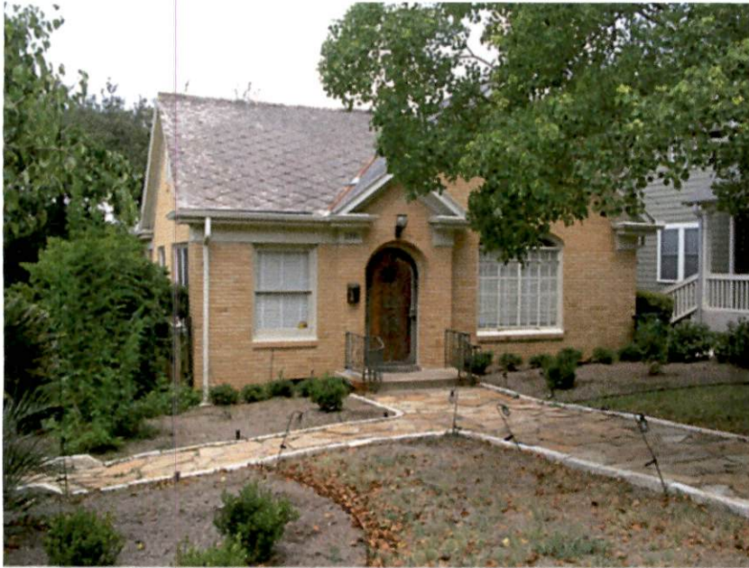
front (east) elevation- no demo work