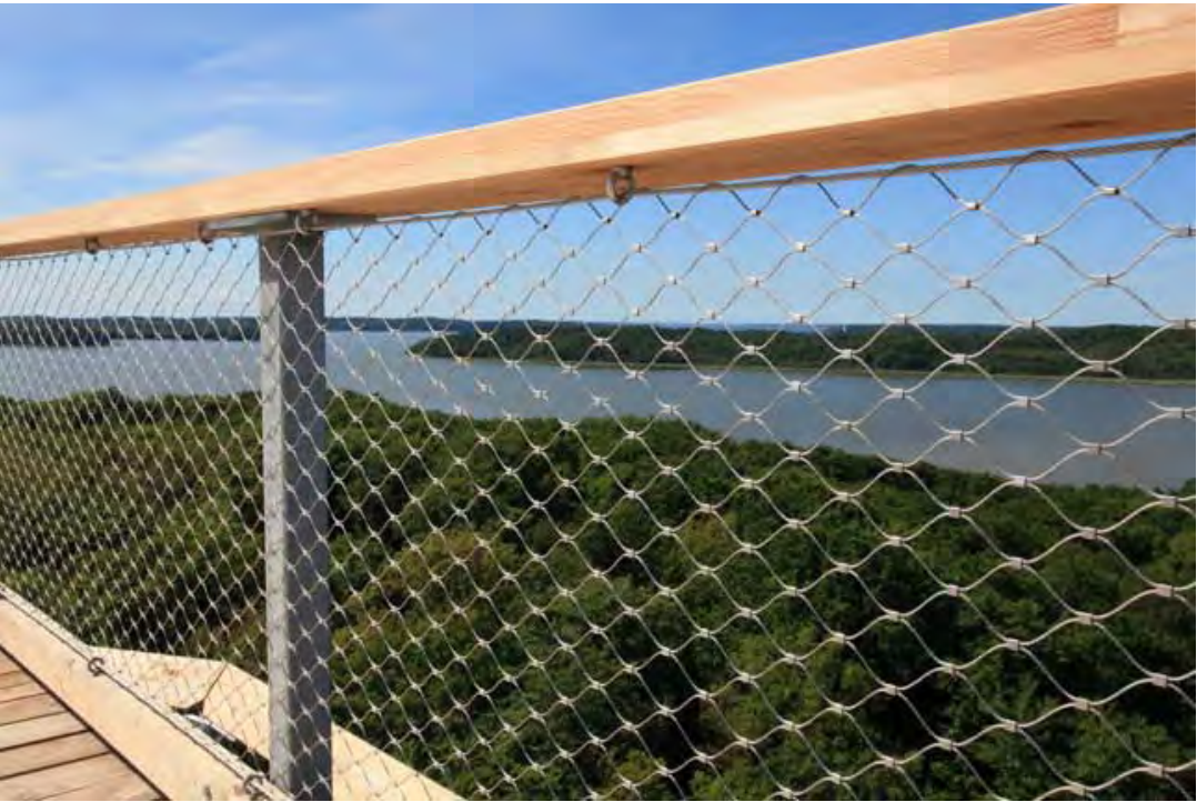
MTL-5 Stainless Steel Wire Netting detail example