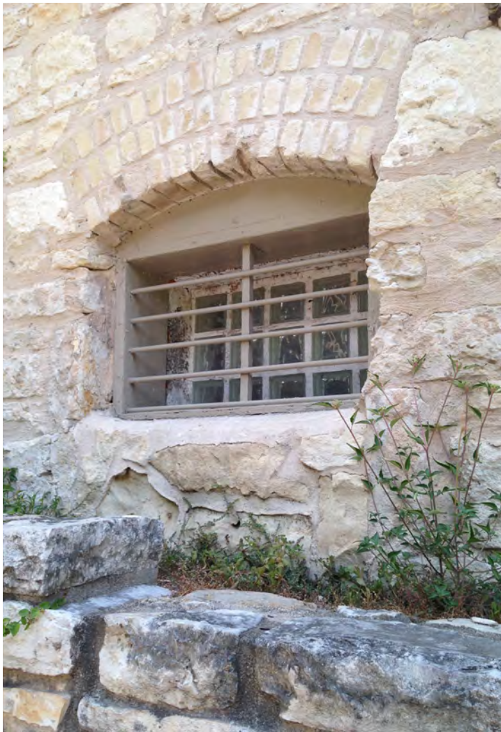
DETAIL 6a Detail of existing window on east side of building