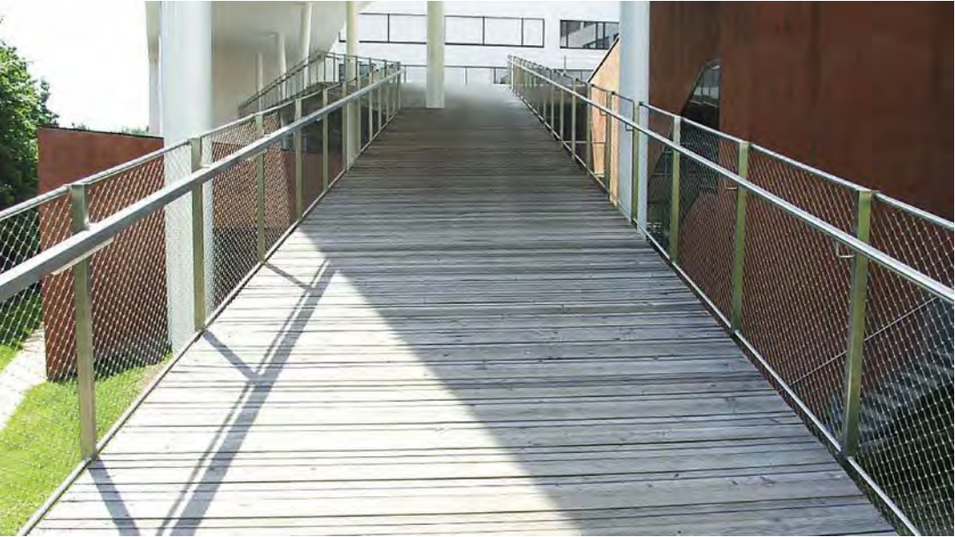
MTL-5 Stainless Steel Wire Netting example