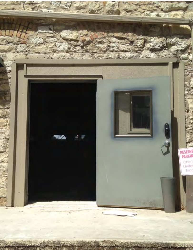
DETAIL 7b Detail of existing door at loading dock