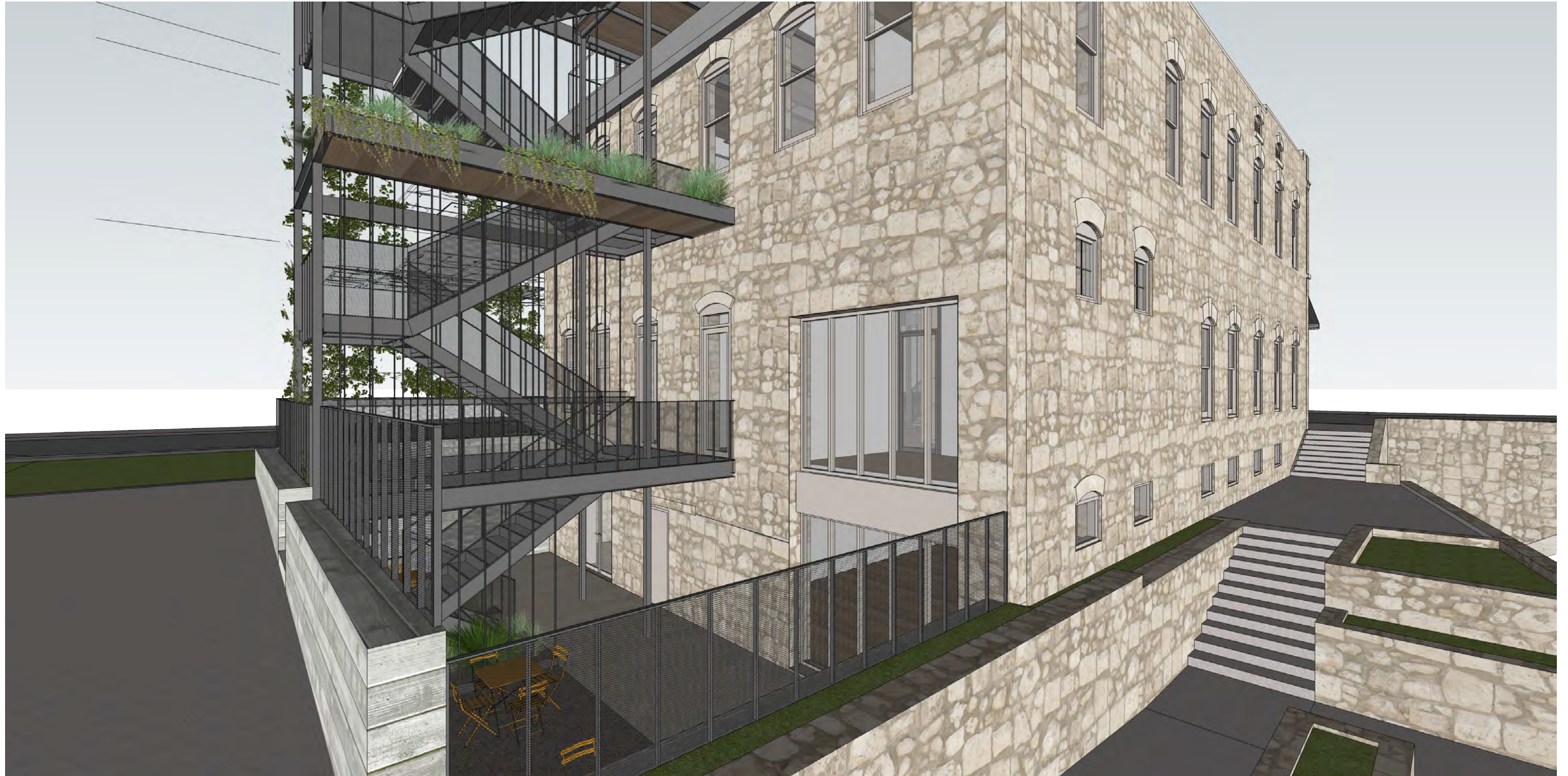
IMAGE 5 Proposed exterior view from E. 6th looking North