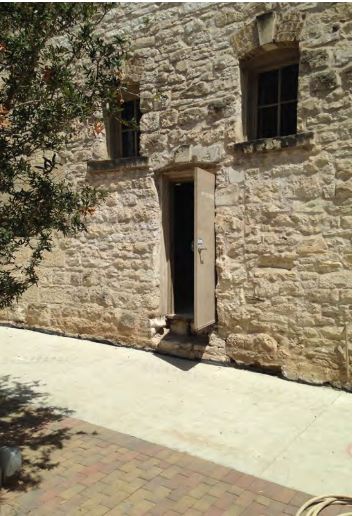
DETAIL 8a Detail of existing door on west side of building