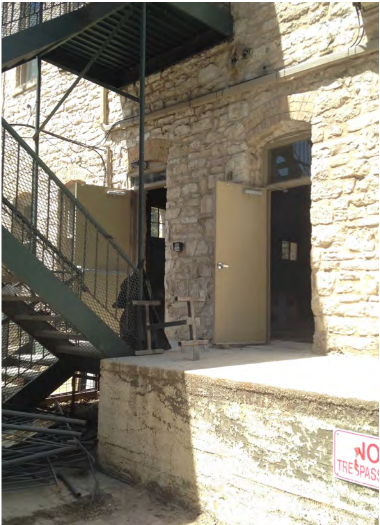
DETAIL 7a Detail of existing doors on the south side of building