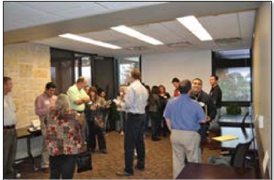
Mueller Contractor Fair