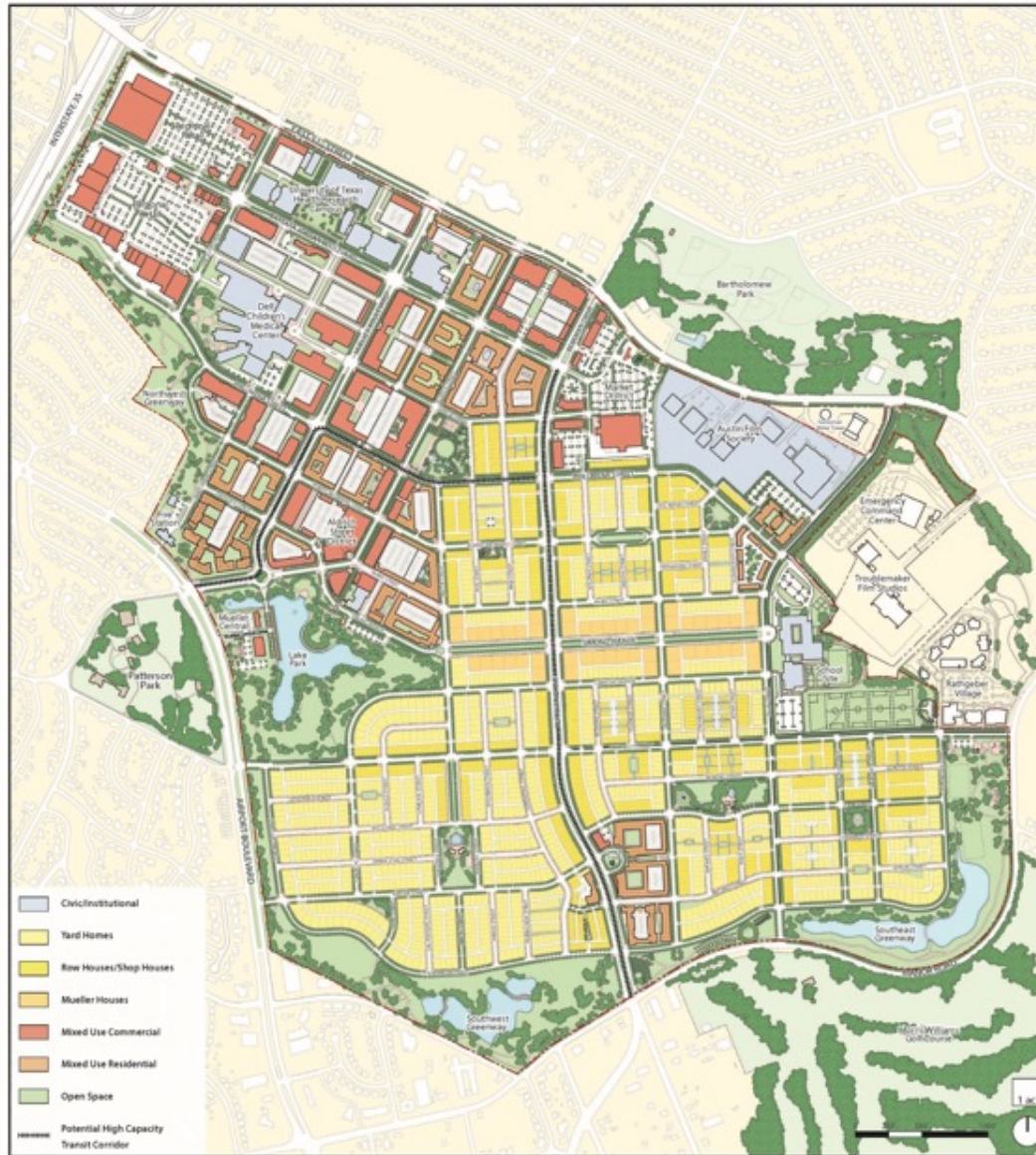
The information contained in this site plan is subject to change without notice. Callisto