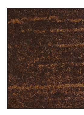
Natural Corten Finish (Powder Coated)