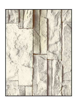
Local Austin Limestone