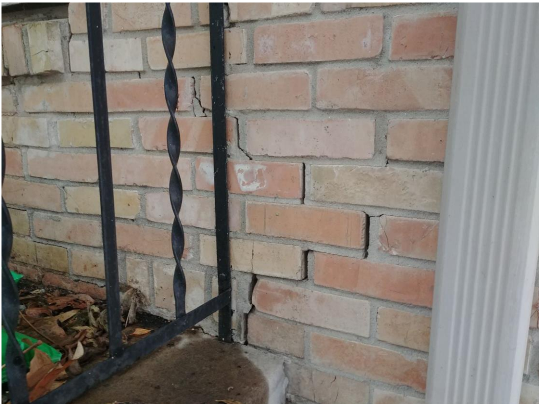
West elevation at front porch