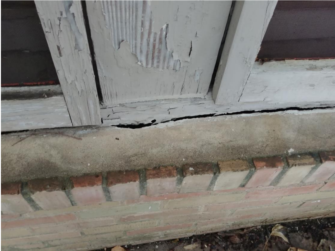
Open sill on west elevation