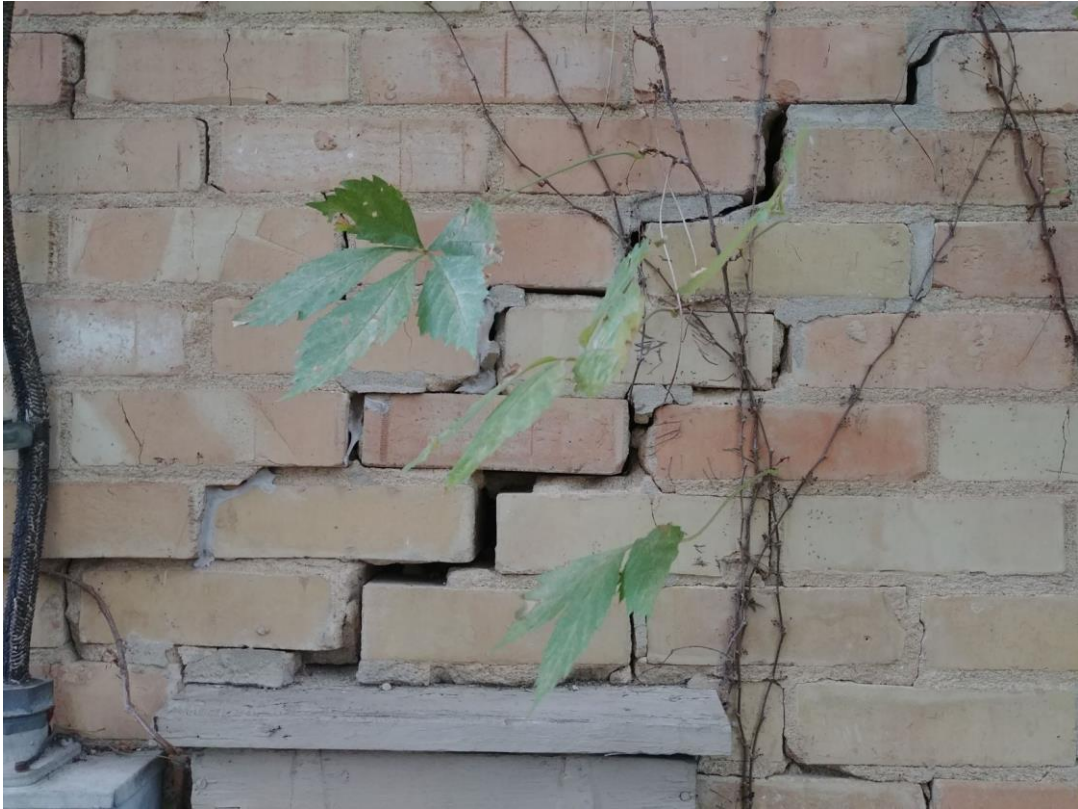
East elevation, low cracks