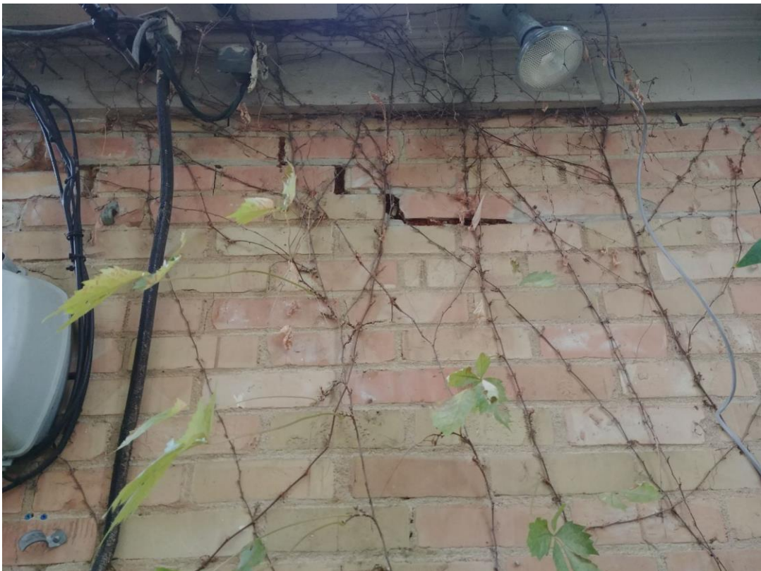
East elevation, high cracks