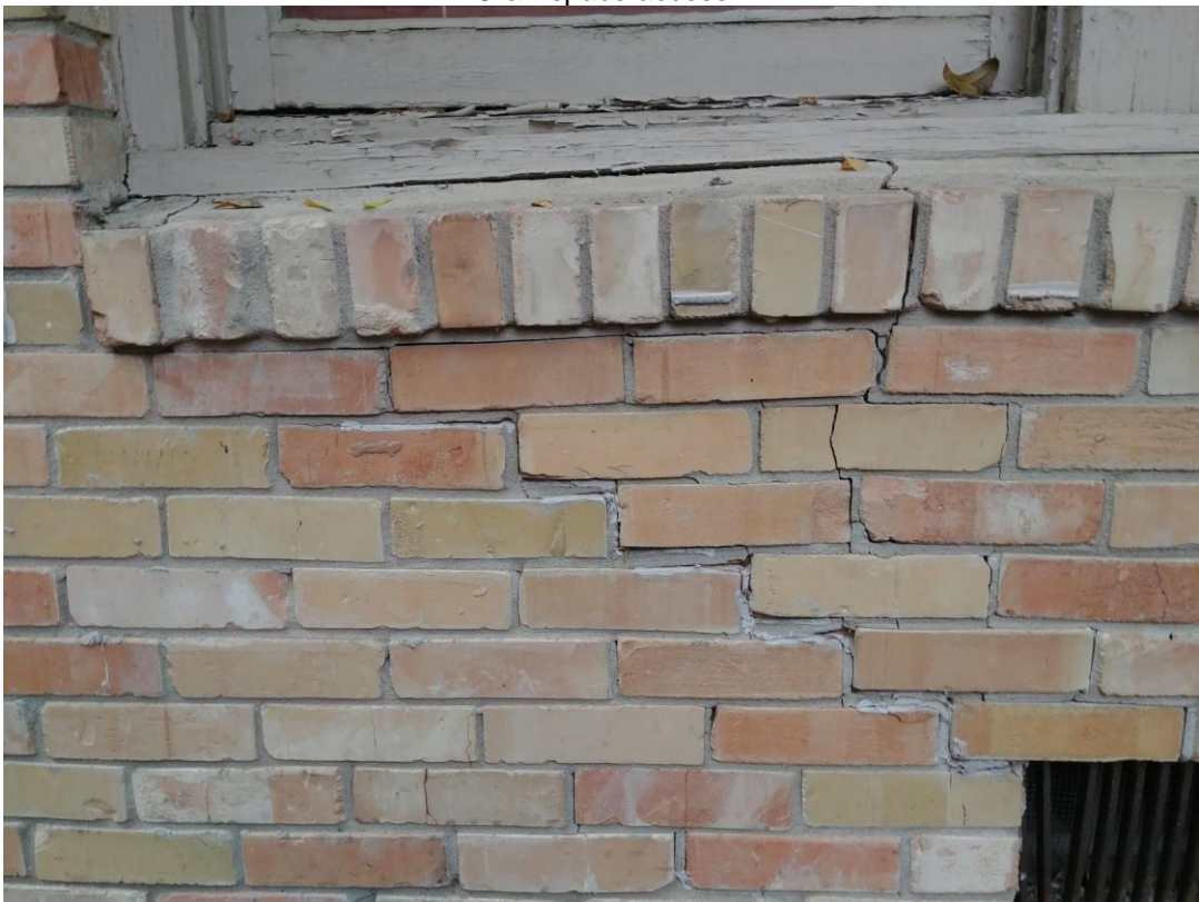
Sinking sill on south elevation