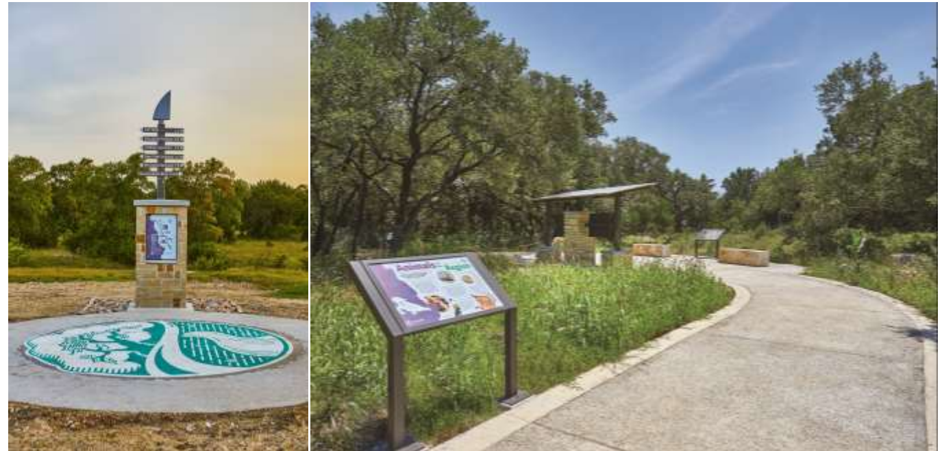
Path features Wayfinding Monuments, Educational Boards and a Hill Country Classroom