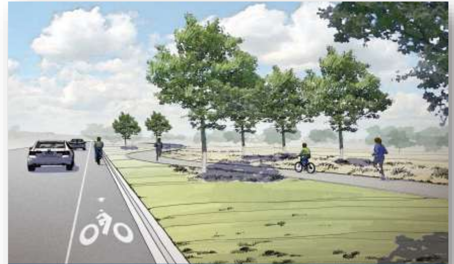
Example of Bike Lanes on Frontage Roads