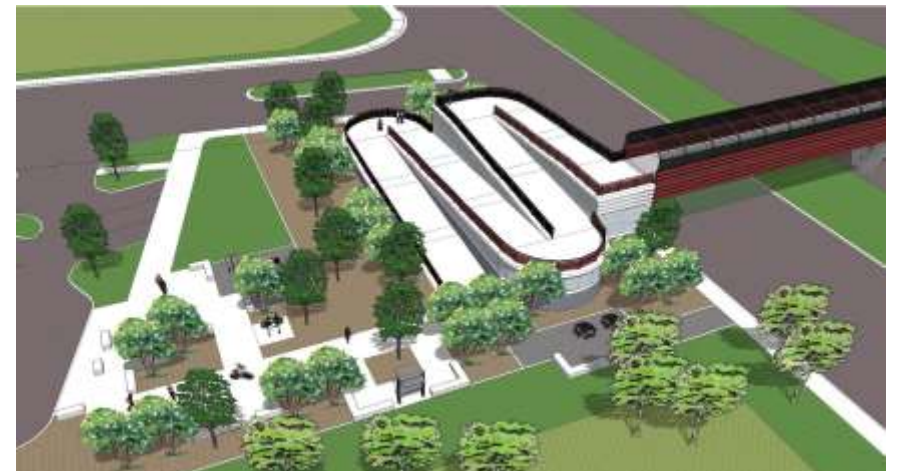
51 st Street Trailhead