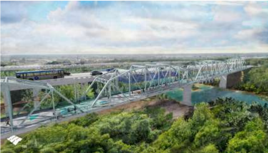
Montopolis Truss Bridge: Future pedestrian bridge