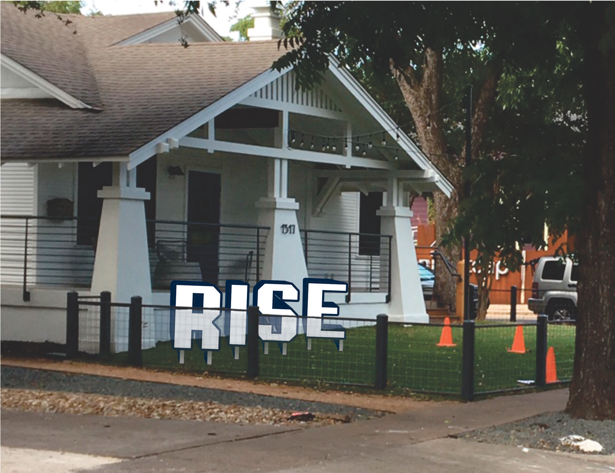
mock up view scale: not to scale