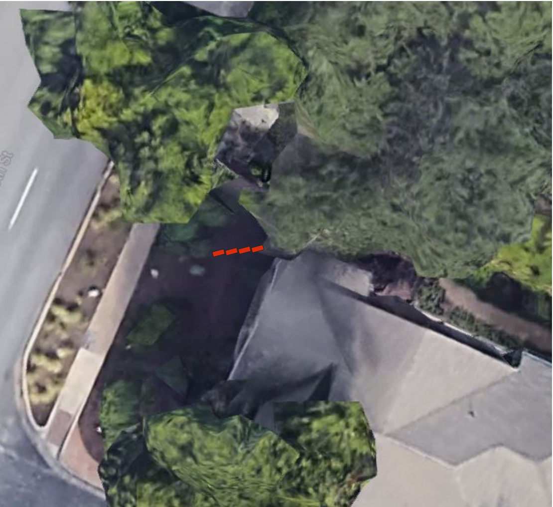
mock up birds eye view scale: not to scale

Storefront width: Total sign area: 29.33 sq ft