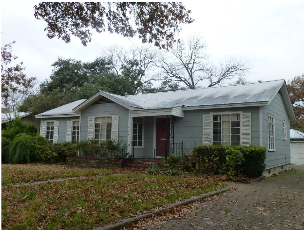
Primary (east) façade and north elevation of 4708 Rue Street.