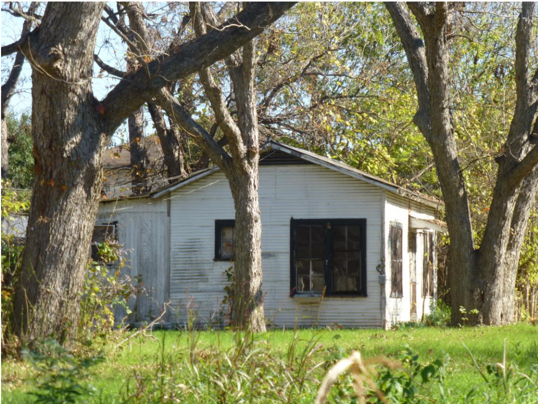
West elevation and south façade of back house.