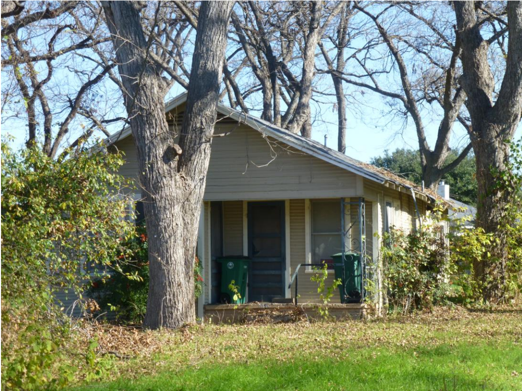
Primary (west) façade of front house at 1135 Walton Lane.