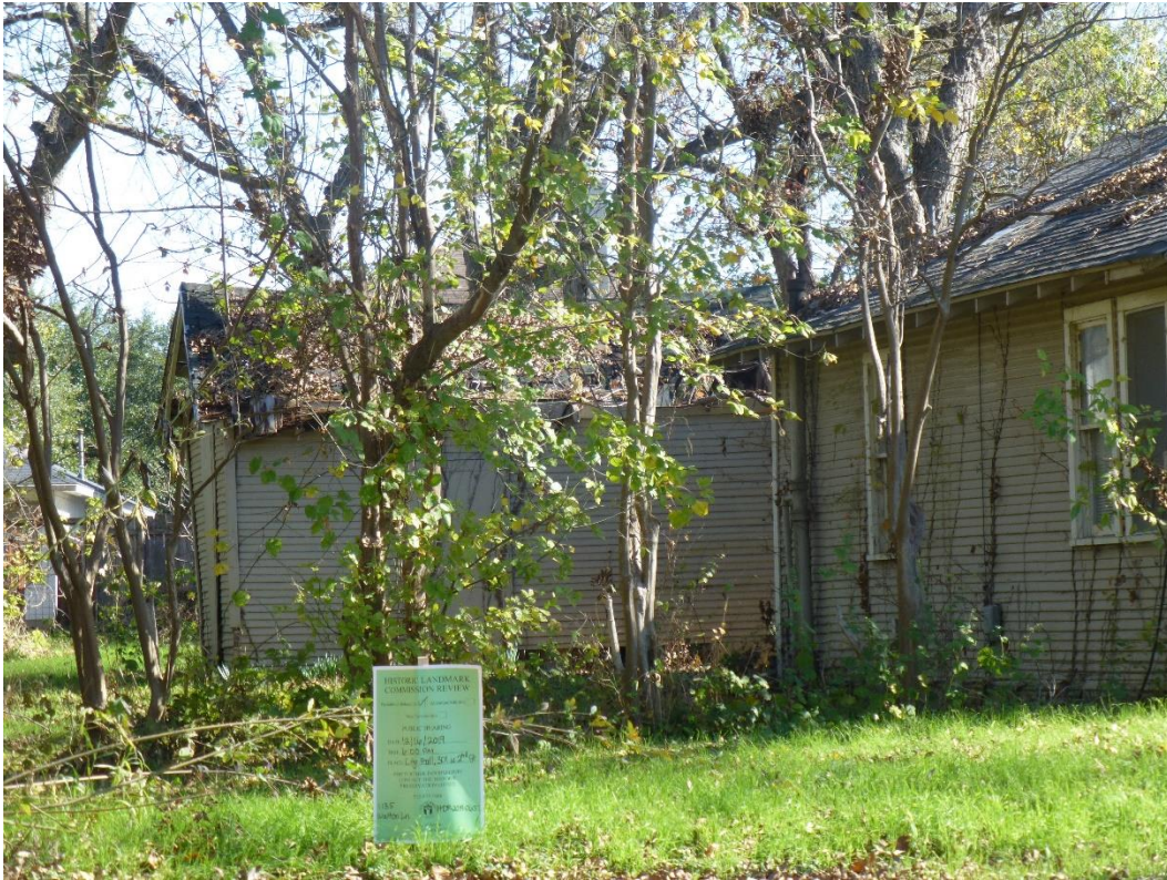
Shed on the property.