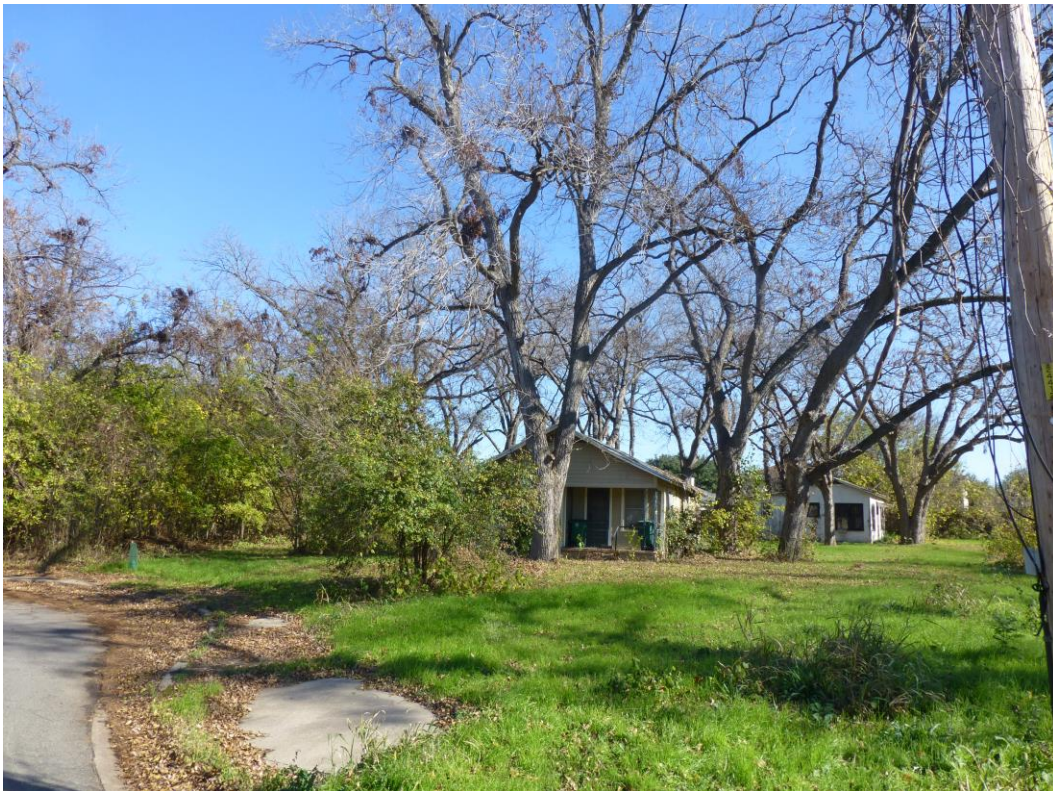
Configuration of front and back houses, looking northeast from Walton Lane.