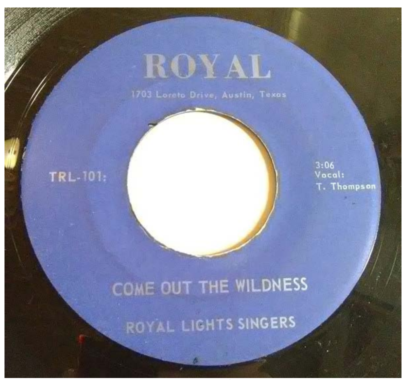
45 produced by the Royal Lights Singers' own label (date unknown) featuring Thompson's vocals. The label's address indicates it was based at the house next door to 3304 E 17<sup>th</sup>. Source: <a href="https://www.discogs.com/Royal-Lights-Singers-Come-Out-The-Wildness-/release/9764781">https://www.discogs.com/Royal-Lights-Singers-Come-Out-The-Wildness-/release/9764781</a>