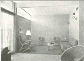
House in NAHB Air Conditioned Village, Austin, Texas, designed for Chrysler Airtemp Air-Cooled Air Conditioning by Fred W. Day and built by Wayne Burns. Cooling coil is located above Chrysler Airtemp Gas Furnace in hall closet. Air-cooled condensing unit for waterless cooling is mounted in wall of storage area at rear of carport at point marked by arrow in top photo. High wall method of air distribution was used because of successful experience of builder and installer with this method in other homes in area. Compact duct system is confined to least used area of house.

Is year 'round air conditioning feasible for builder houses? The introduction of Chrysler Airtemp waterless, all-electric cooling over a year ago made it practical and economical for any house—anywhere! From actual installations in homes in every section of the country the proof has been recorded. And now, to make it official, there's final proof in the making at the "Chrysler Airtemp House" in NAHB's Air Conditioned Village.