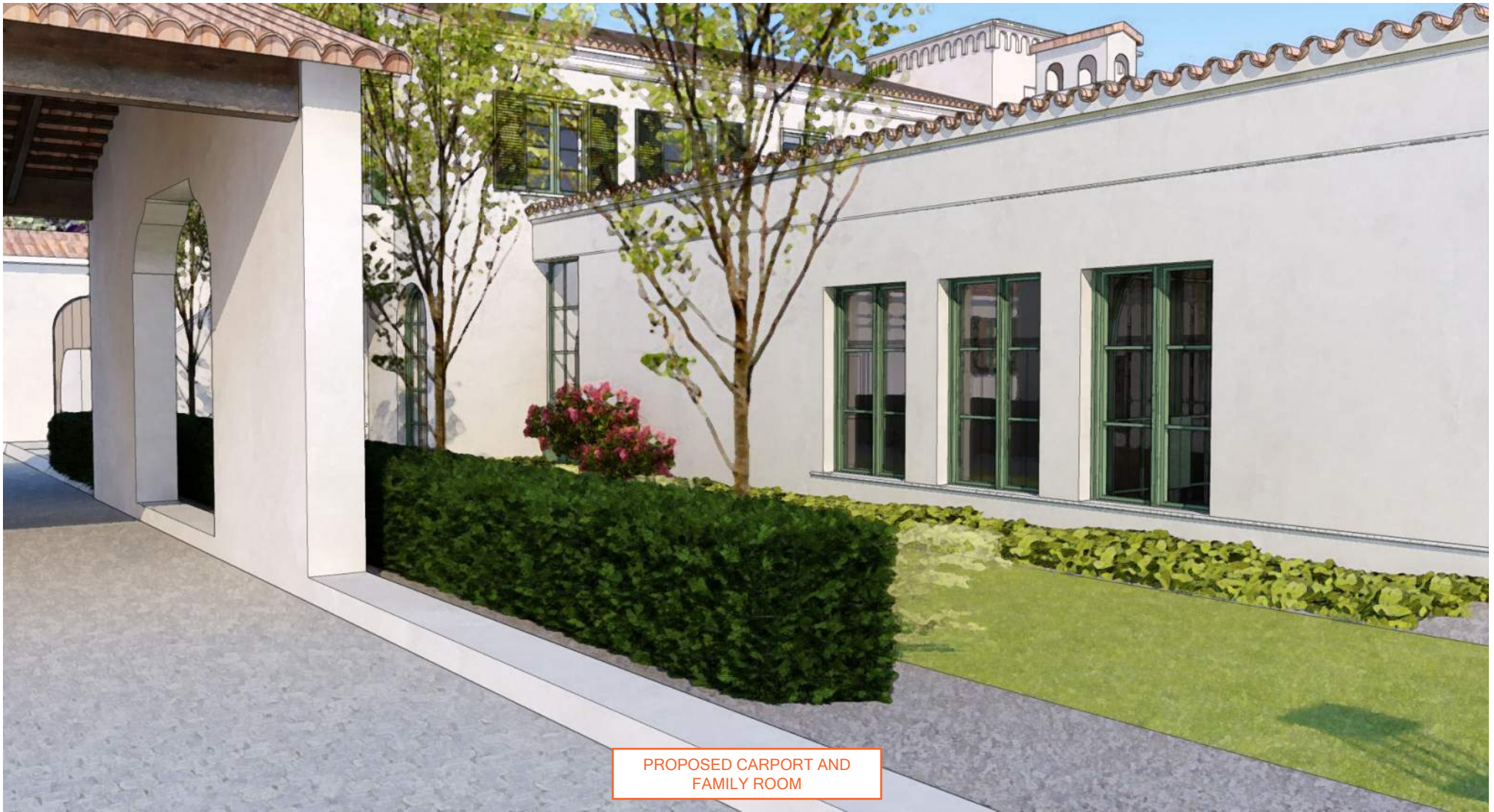
PROPOSED CARPORT AND FAMILY ROOM