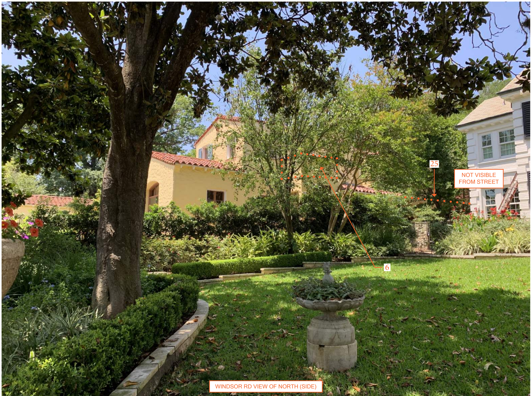
WINDSOR RD VIEW OF NORTH (SIDE)