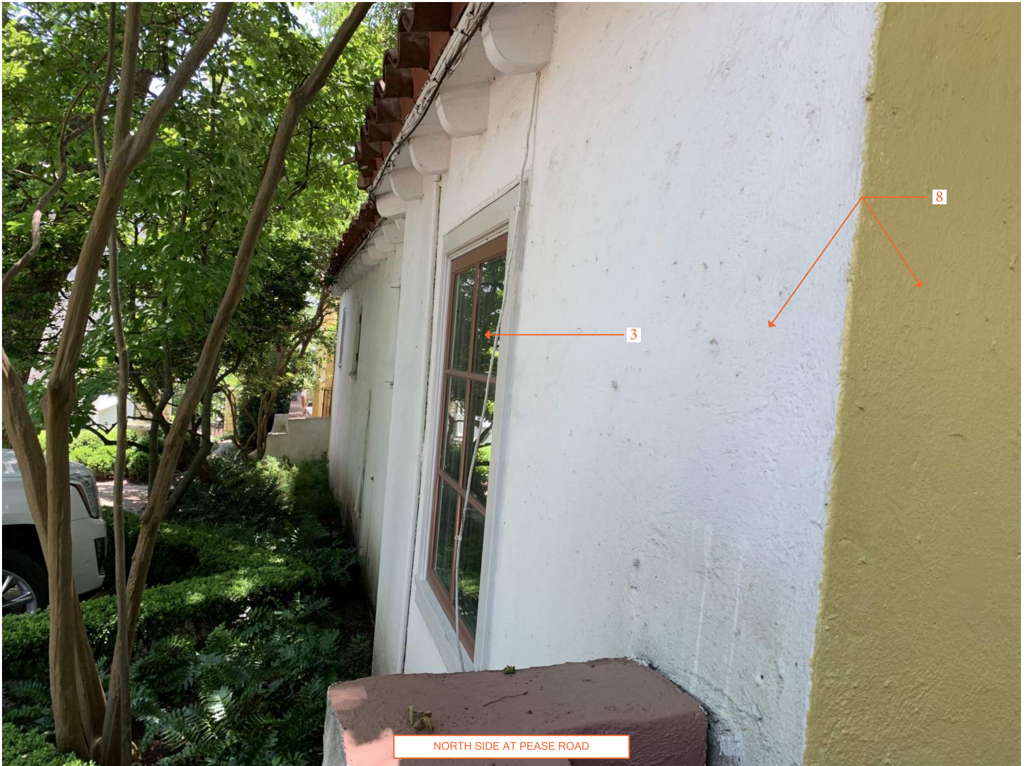
NORTH SIDE AT PEASE ROAD