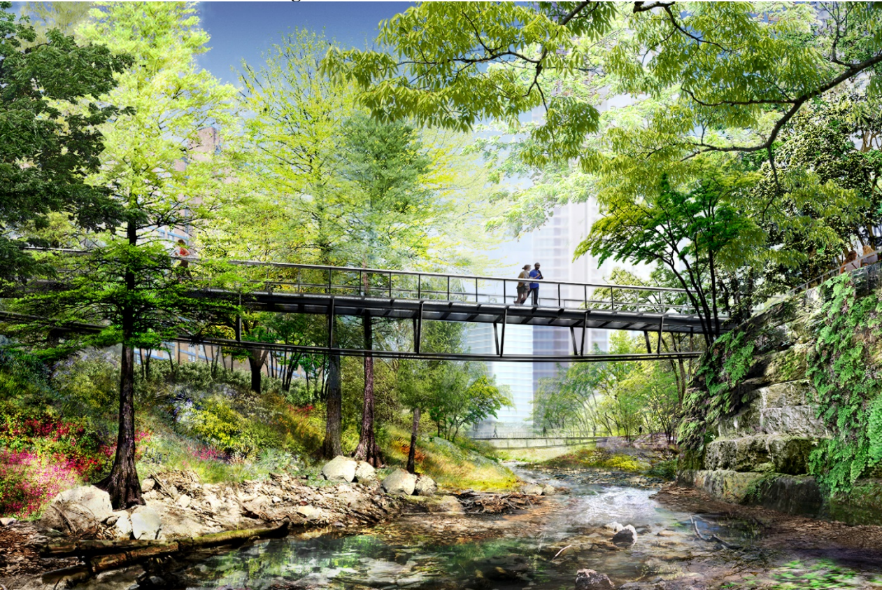
Exhibit E. Creek Delta Rendering Between Cesar Chavez and Lady Bird Lake