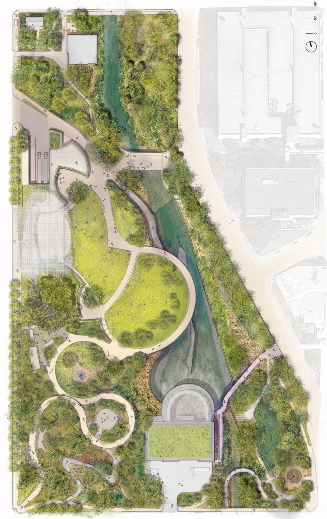
Exhibit D. Waterloo Park Rendered Site Plan, including the Moody Amphitheater