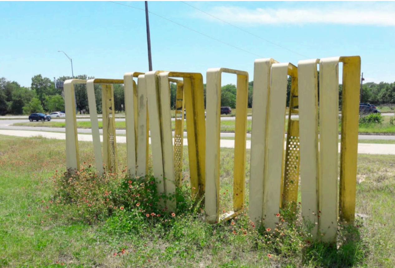
Detail showing current condition of a large-scale “tunnels”