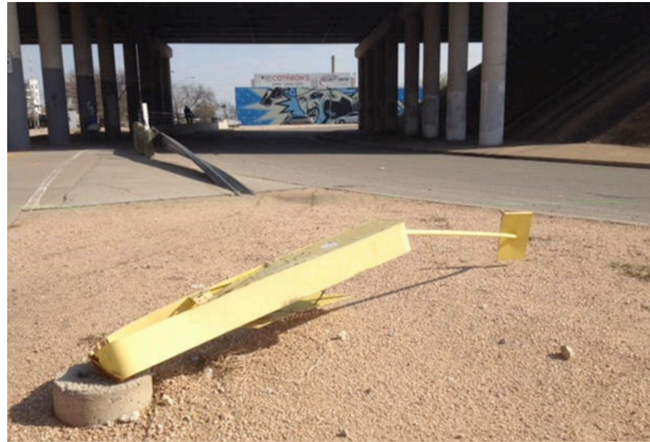
Detail showing current condition of a free-standing solar-powered sign