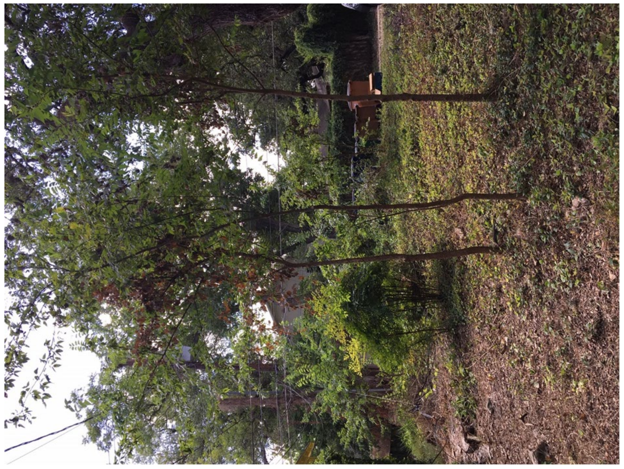
Some dead vines in small trees recently pruned by either customer or tenant?