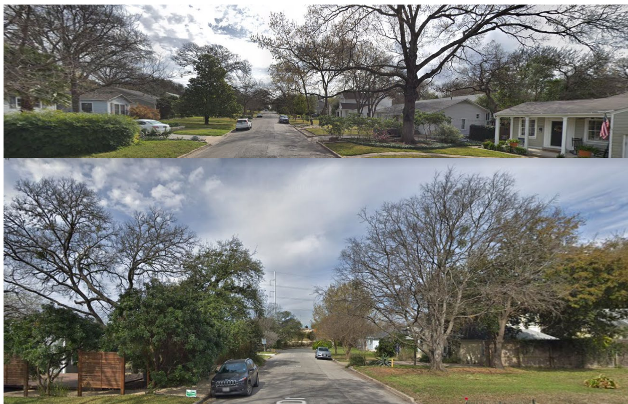
Mohle Drive looking east and west. Original house with flag at far right in top image; offscreen to left in bottom.