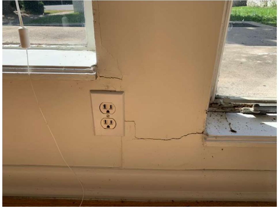
CONDITION OF INTERIOR WALL