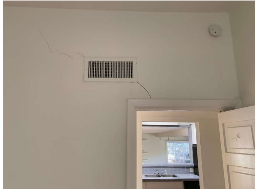
CONDITION OF INTERIOR WALL