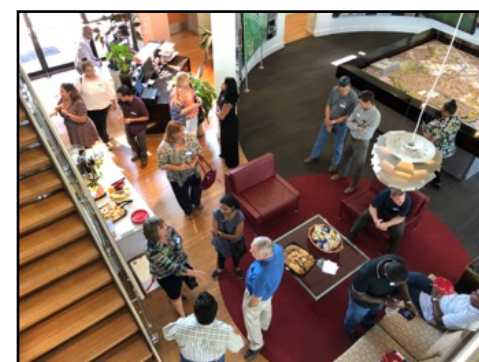
August 28, 2019 Networking Event