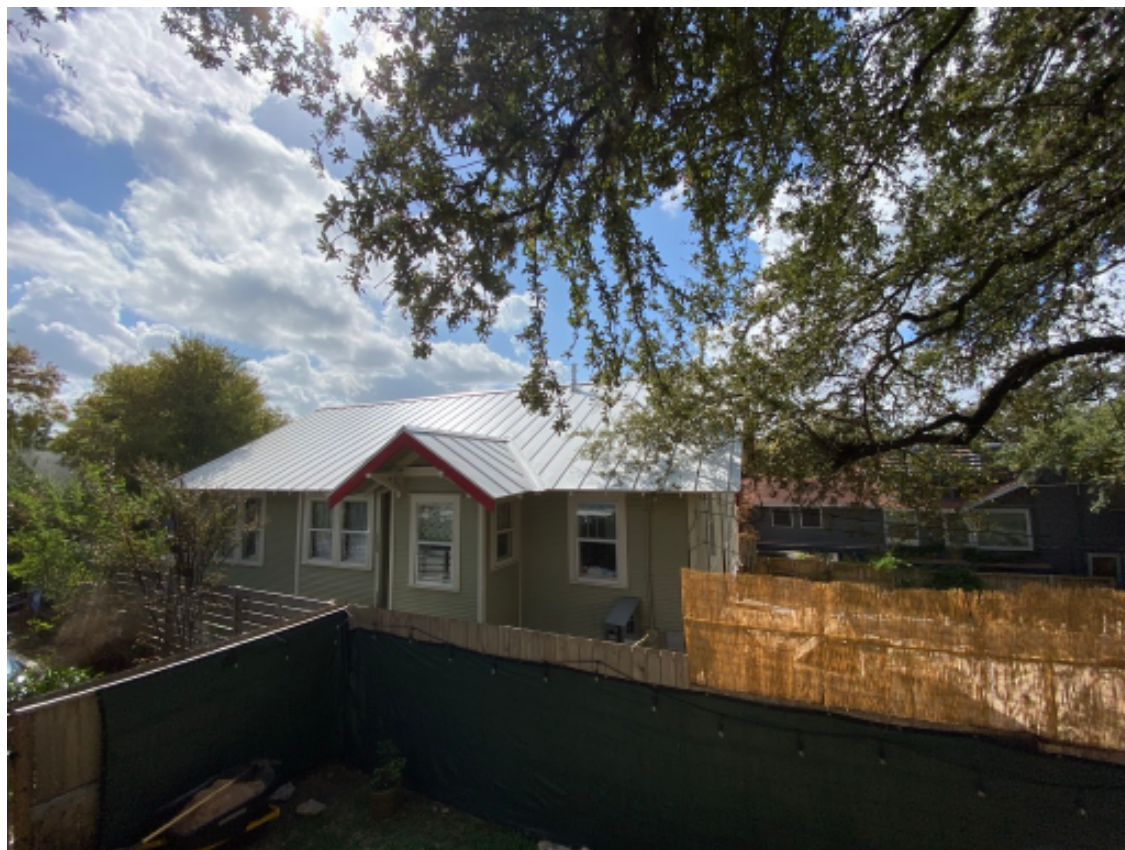
Figure #3: View from north/back side of structure