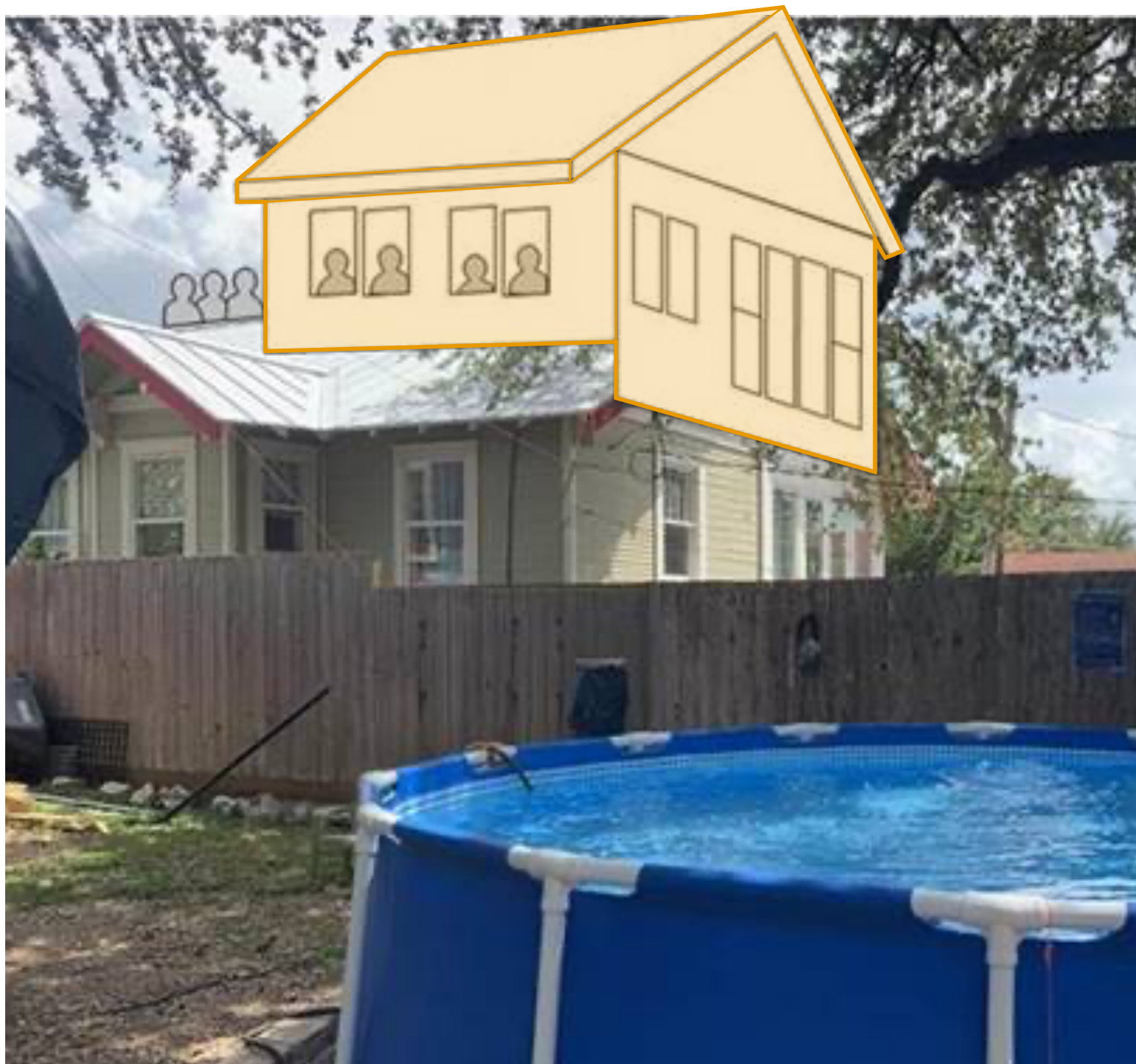
Figure #4: Rendering from back