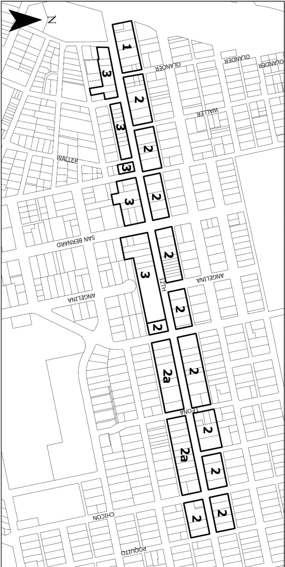
Neighborhood Conservation Combining District (NCCD) Subdistricts for East 12th Street