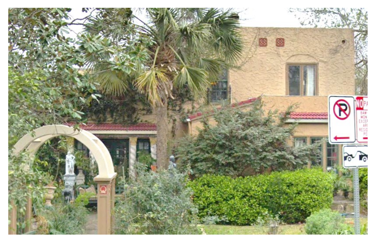
The house at 101 Laurel Lane, where E.C. and Ruth Rather lived for more than two decades prior to moving into the Mountainview Road house around 1951