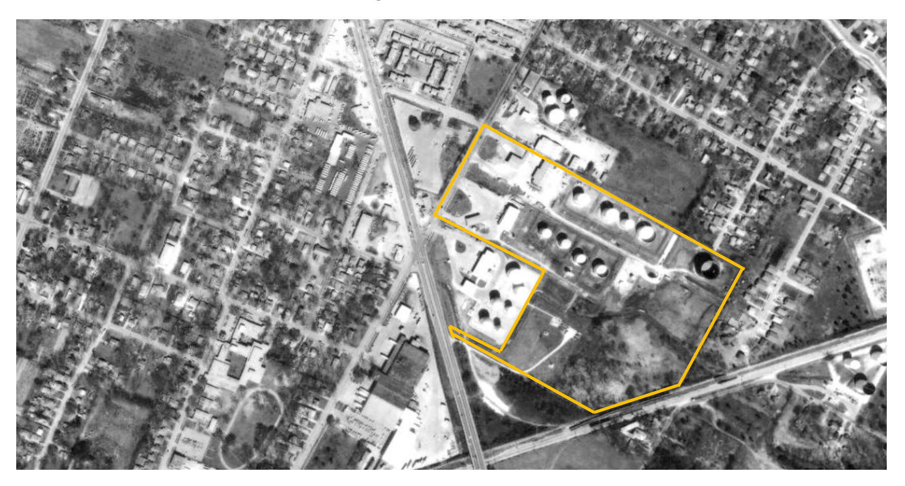
Figure 1. Site Aerial (1987)