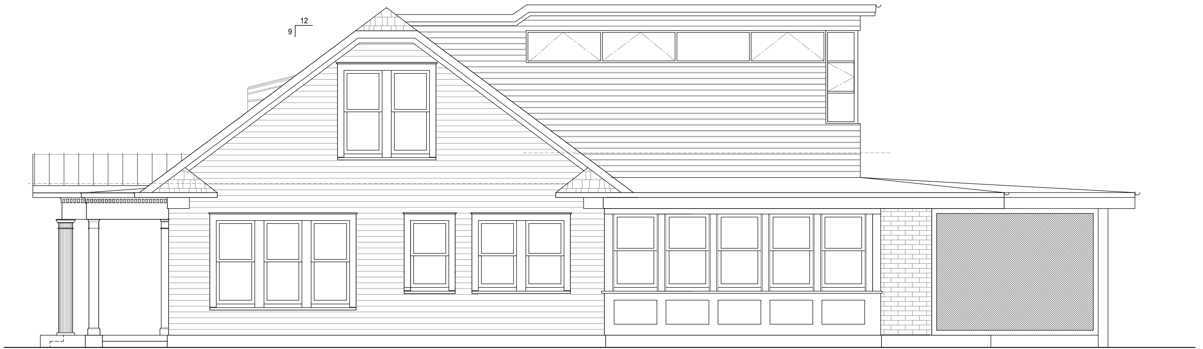
1 SOUTH ELEVATION SCALE AS NOTED