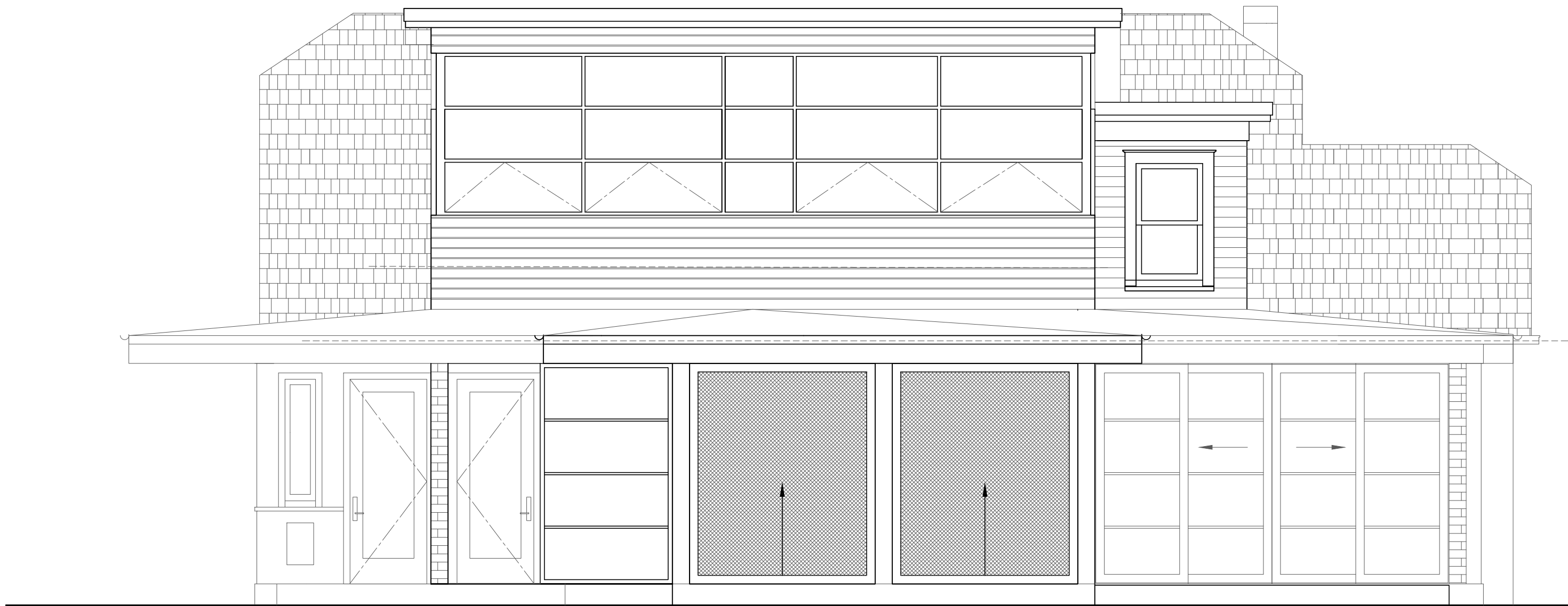
1 EAST ELEVATION SCALE AS NOTED