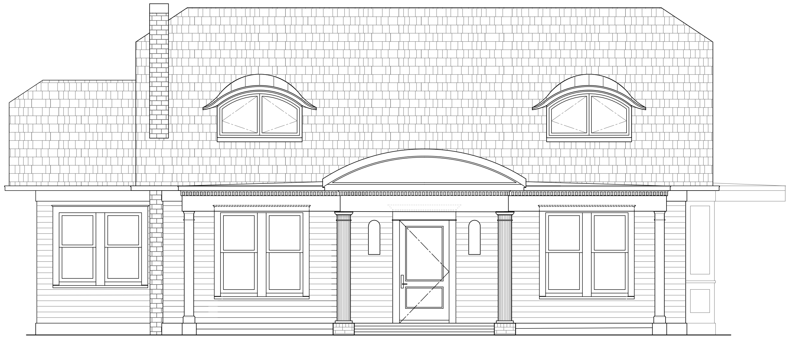
1 WEST ELEVATION SCALE AS NOTED