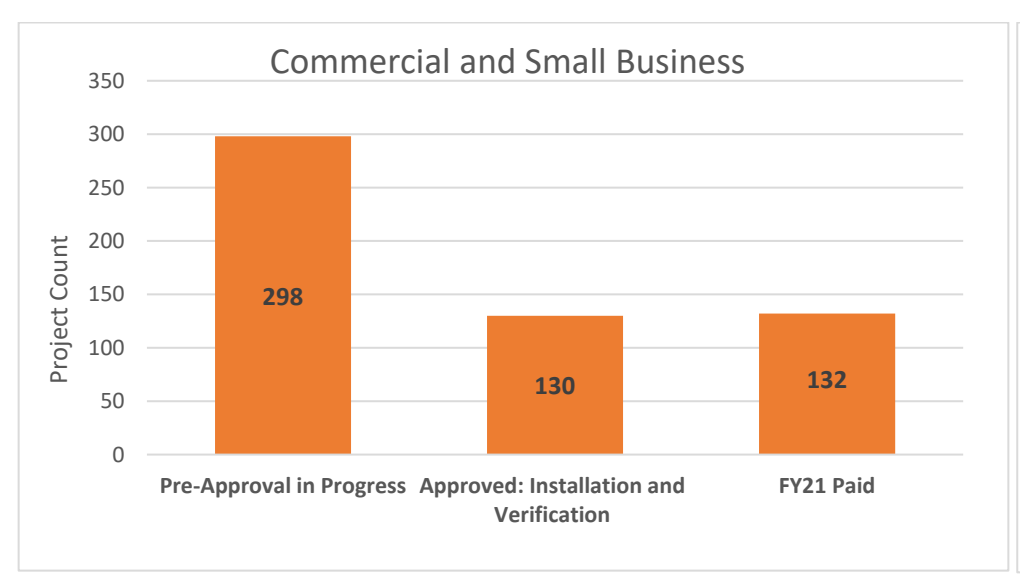
Figure 1: Commercial and Multifamily Project Pipeline