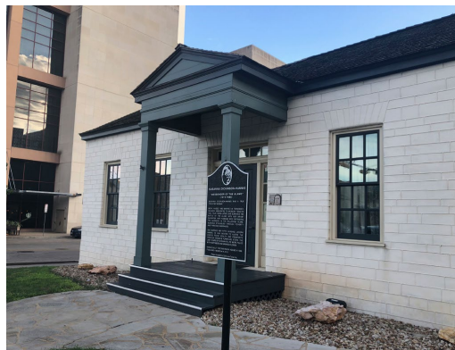
Susanna Dickinson Museum (current)