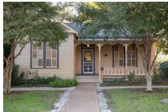
O. Henry Museum (Current)