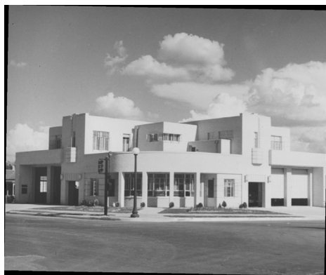
Fire Station #1 (Austin History Center, 1938)

Park improvements are organized into two phases. The first phase continues use of both the parking lot and fire station on site.