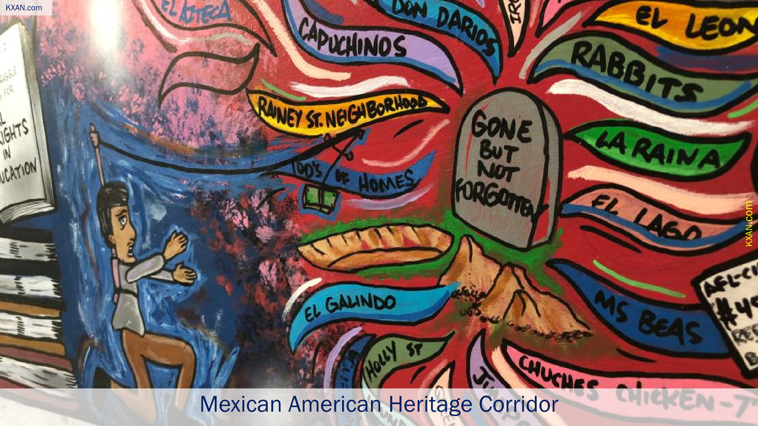
Mexican American Heritage Corridor