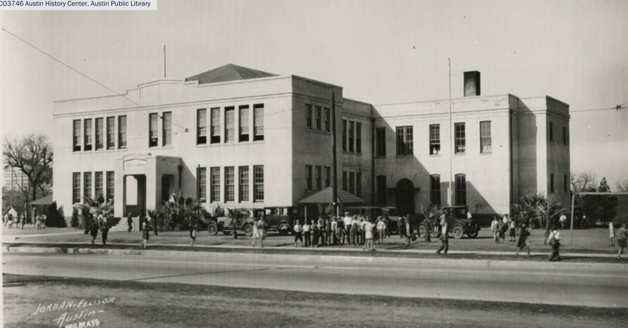
Sir Swante Palm School