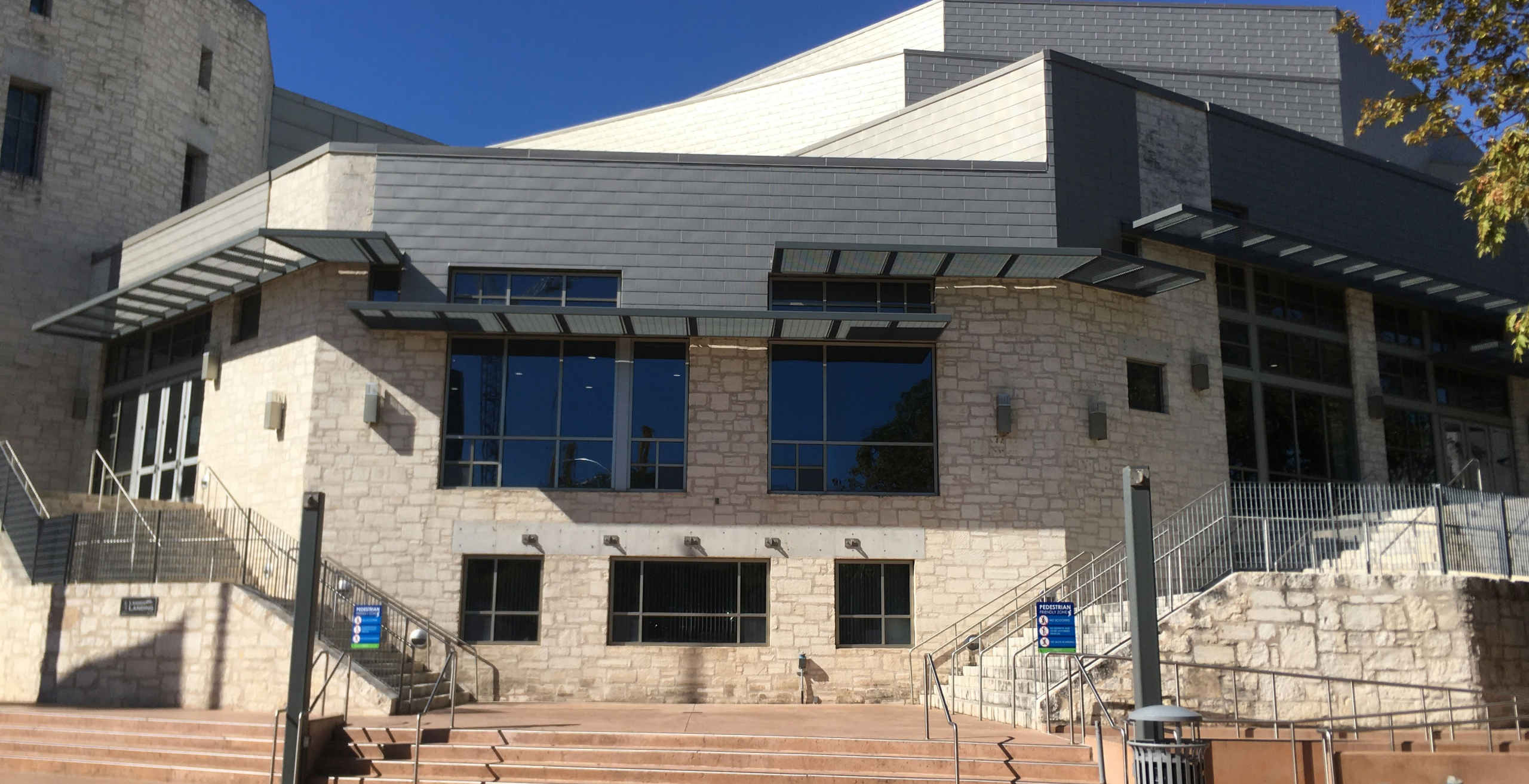
Neil Kocurek Memorial Austin Convention Center