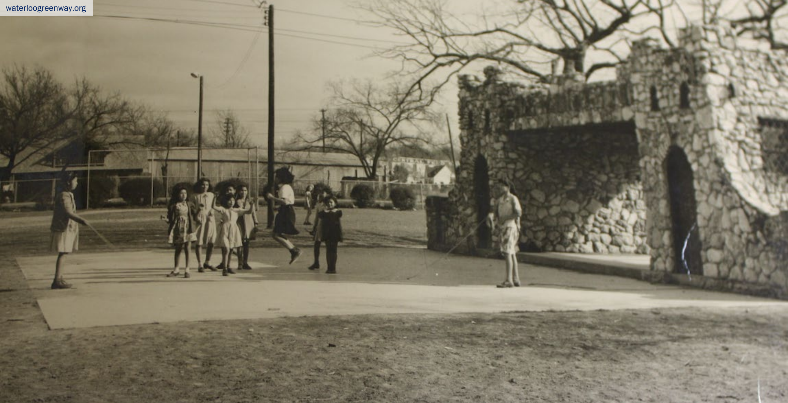
Sir Swante Palm Neighborhood Park