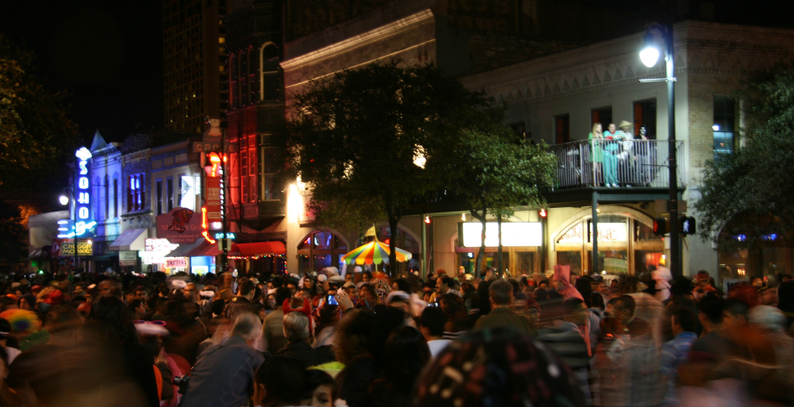
Sixth Street Historic and Entertainment District