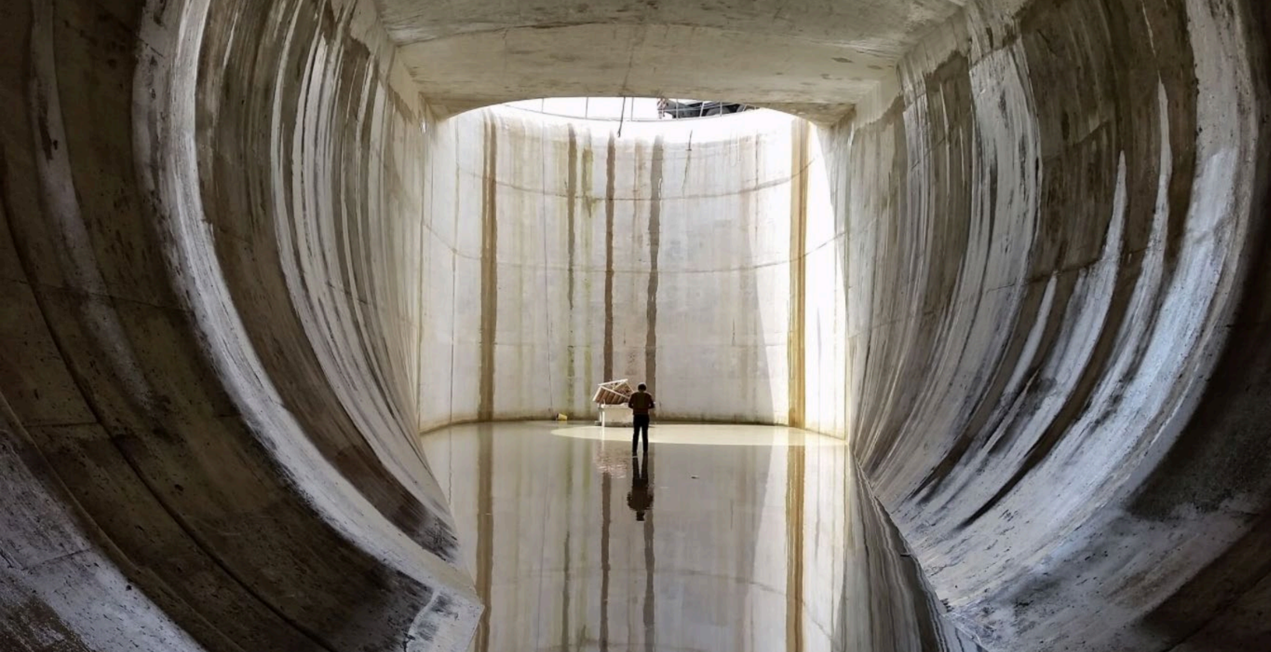
Waller Creek Tunnel