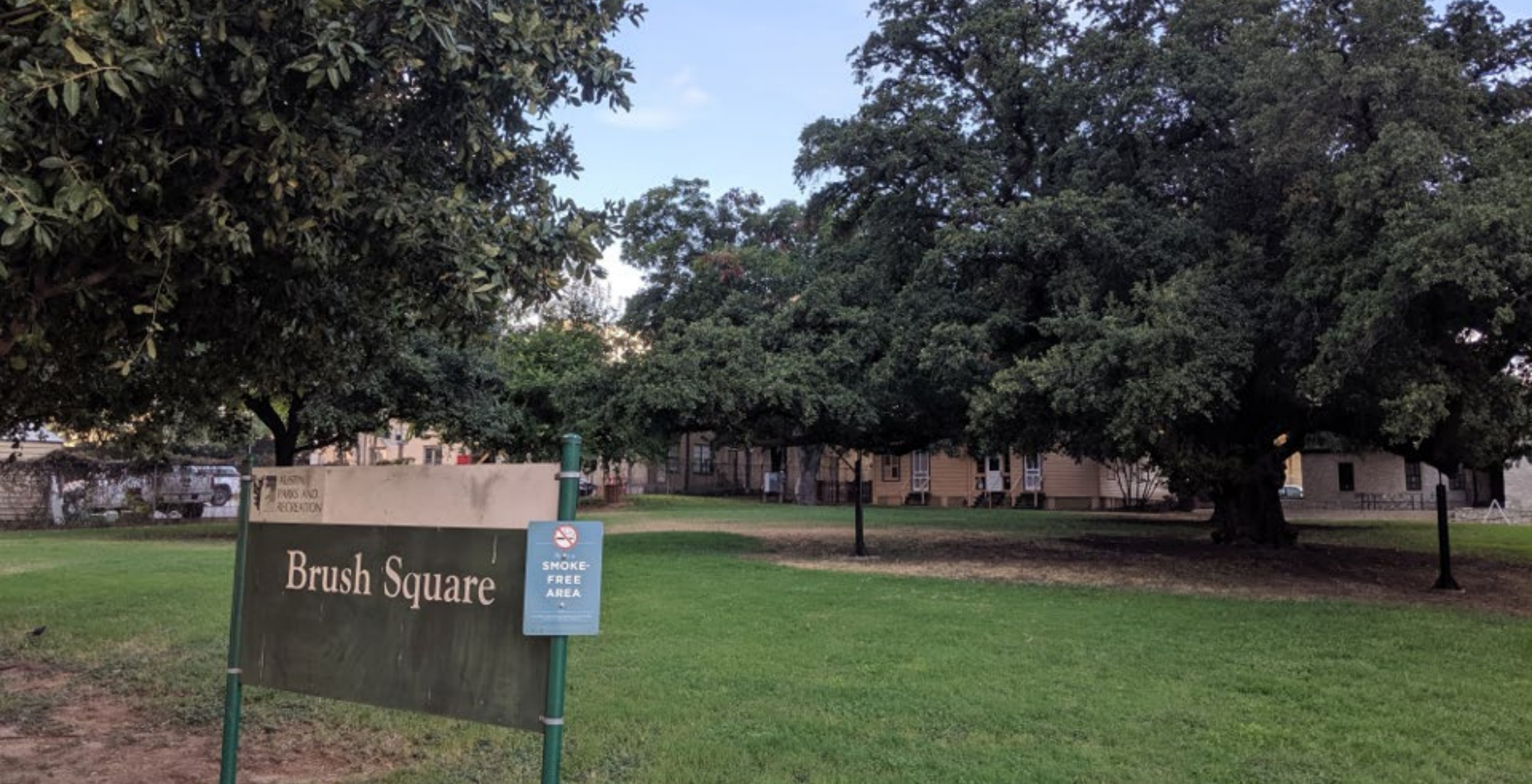
Brush Square/O. Henry Museum