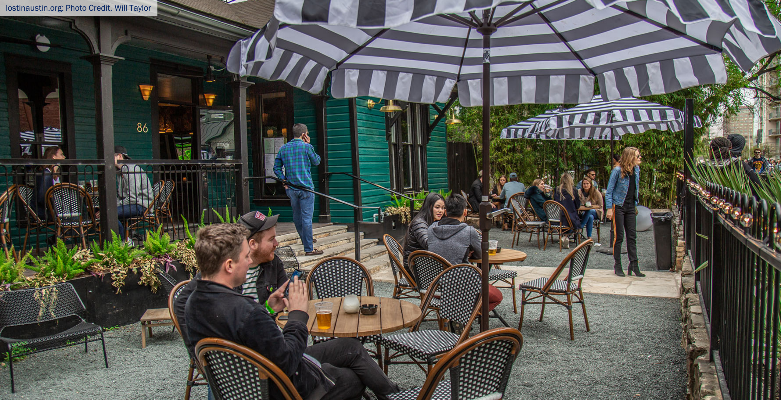
Rainey Street Neighborhood & Historic District