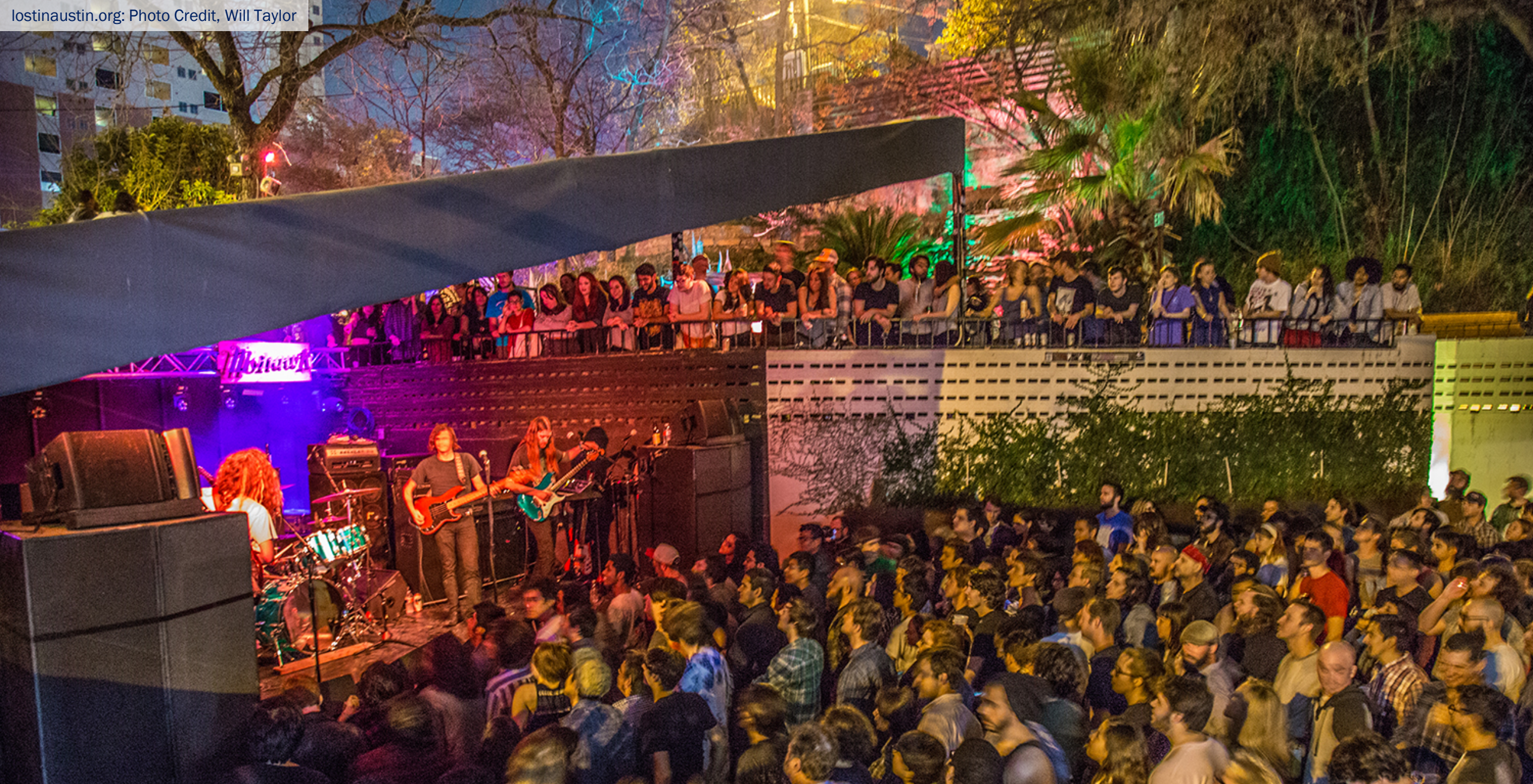
Red River Cultural District