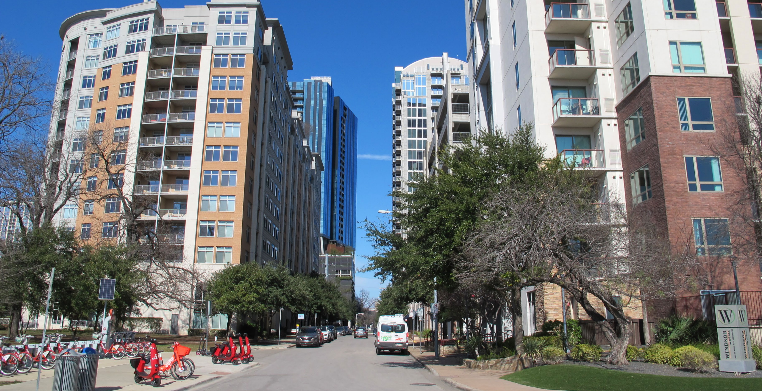
Rainey Street Neighborhood & Historic District