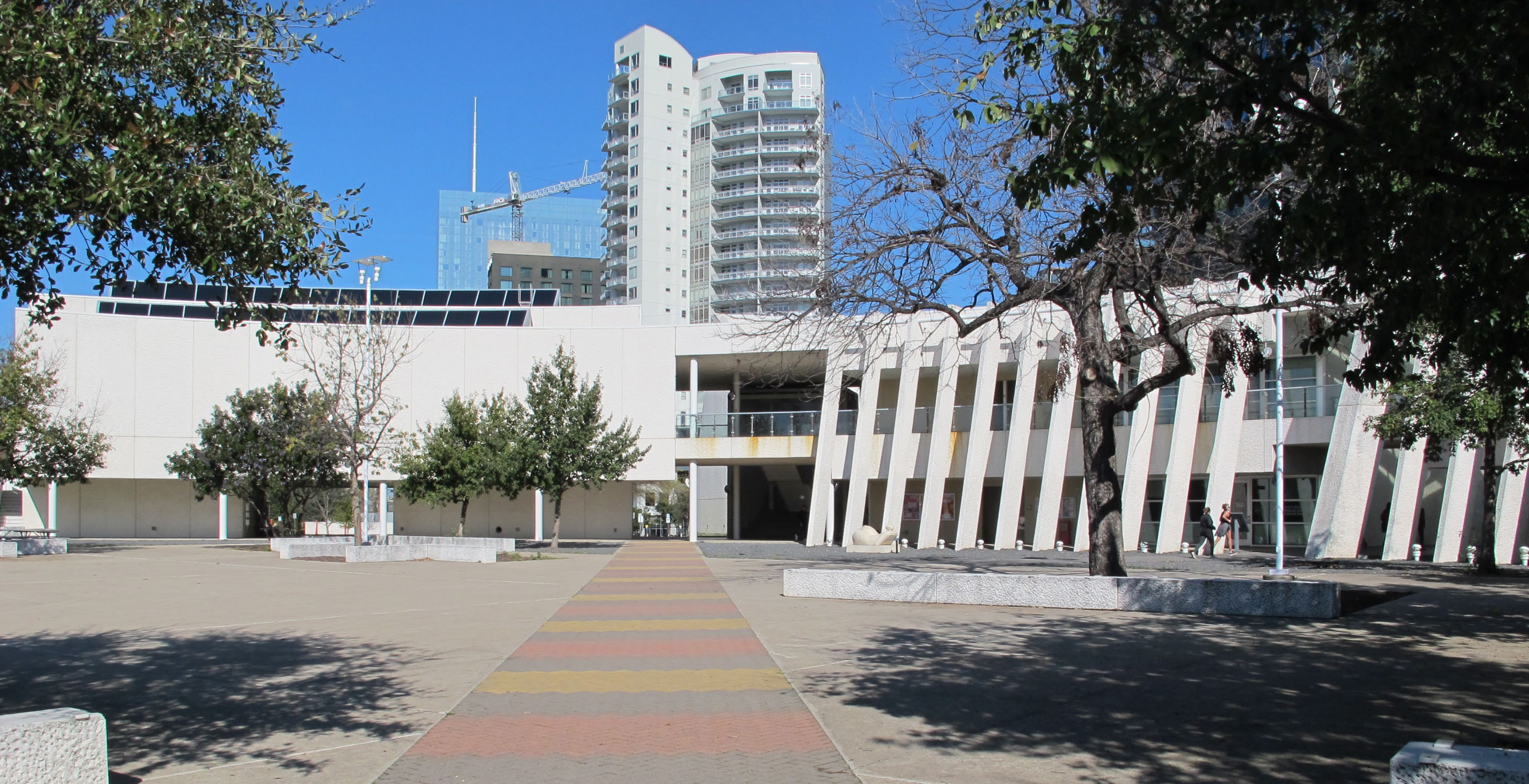
Emma S. Barrientos Mexican American Cultural Center (ESB-MACC)