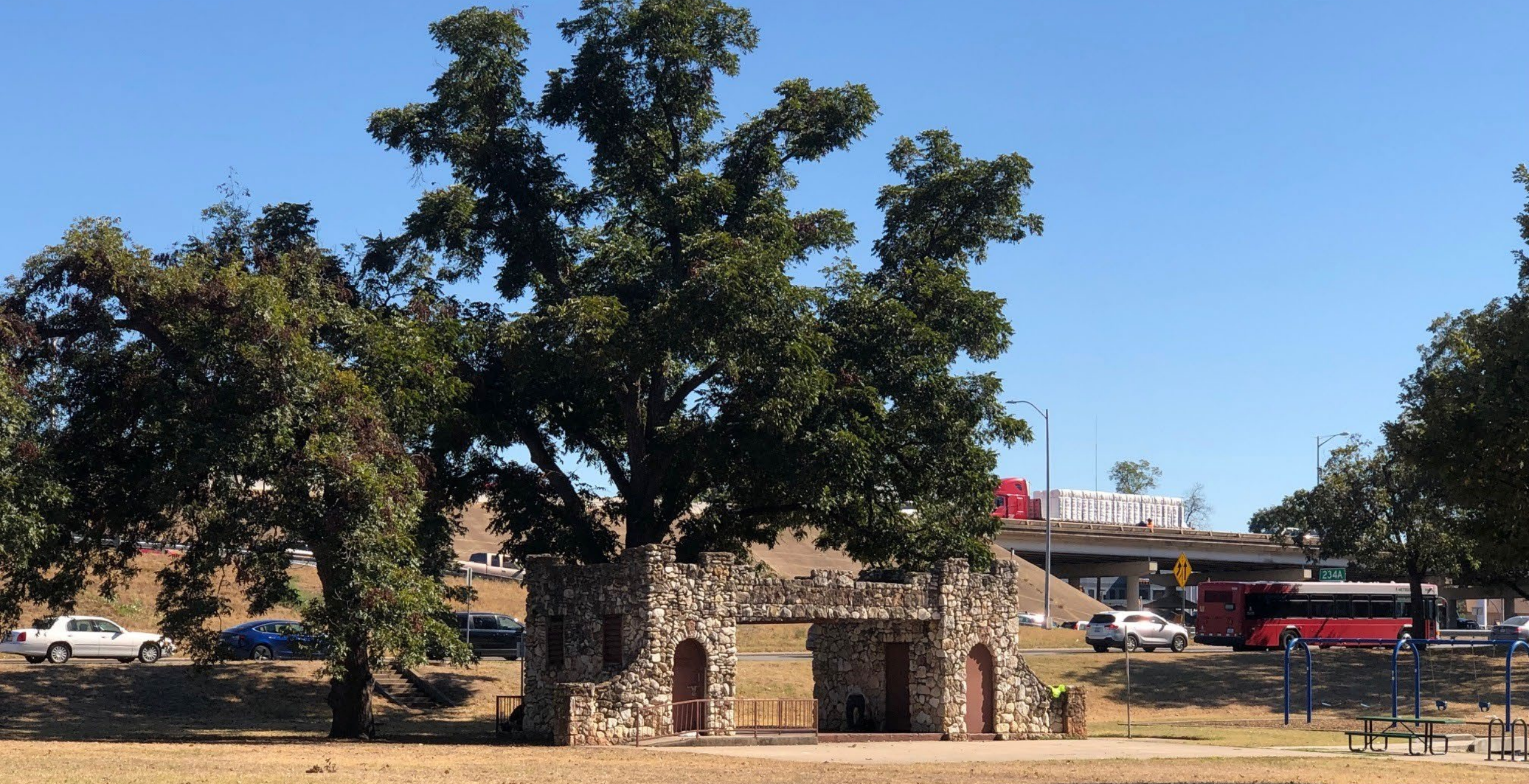
Sir Swante Palm Neighborhood Park