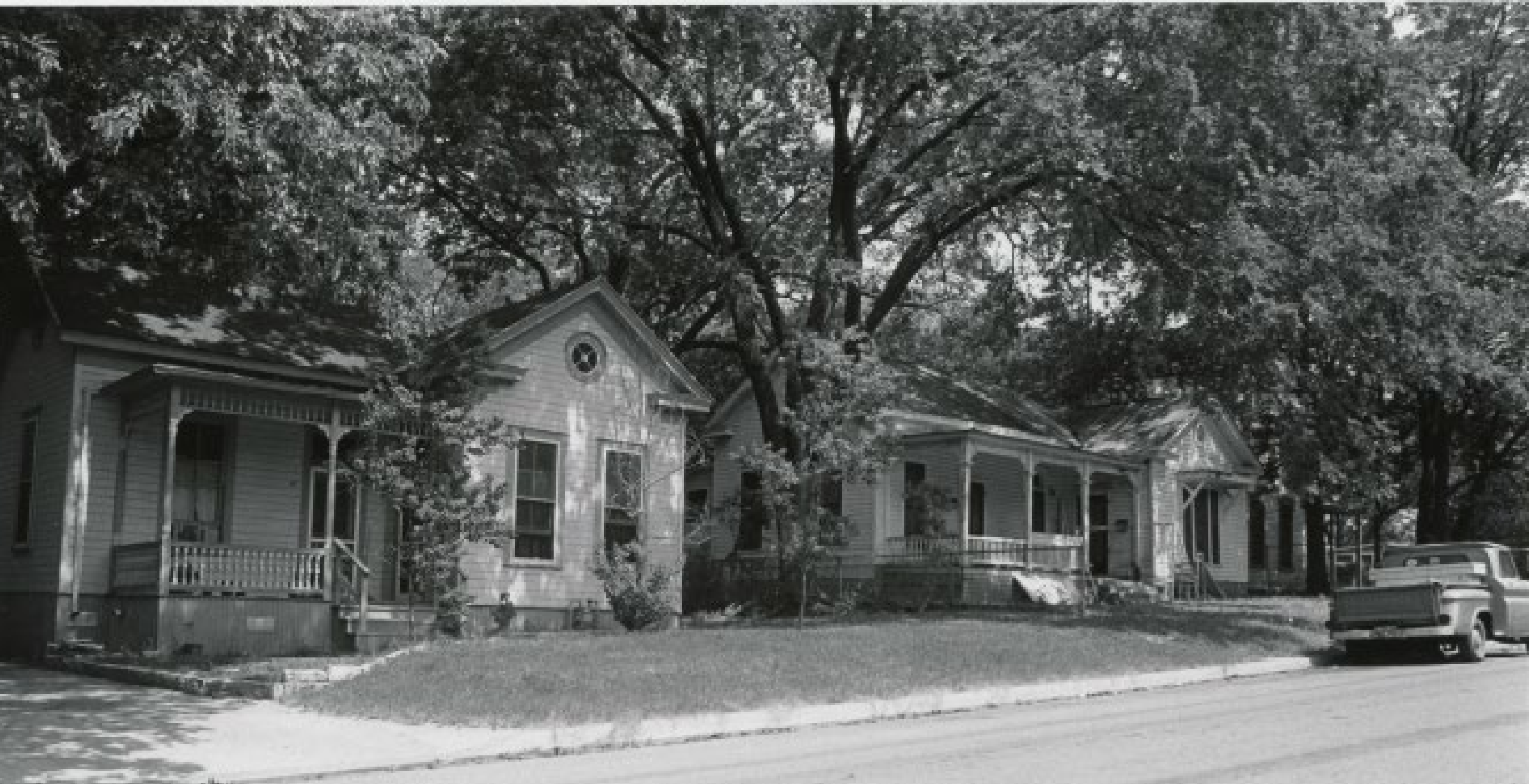
Rainey Street Neighborhood & Historic District