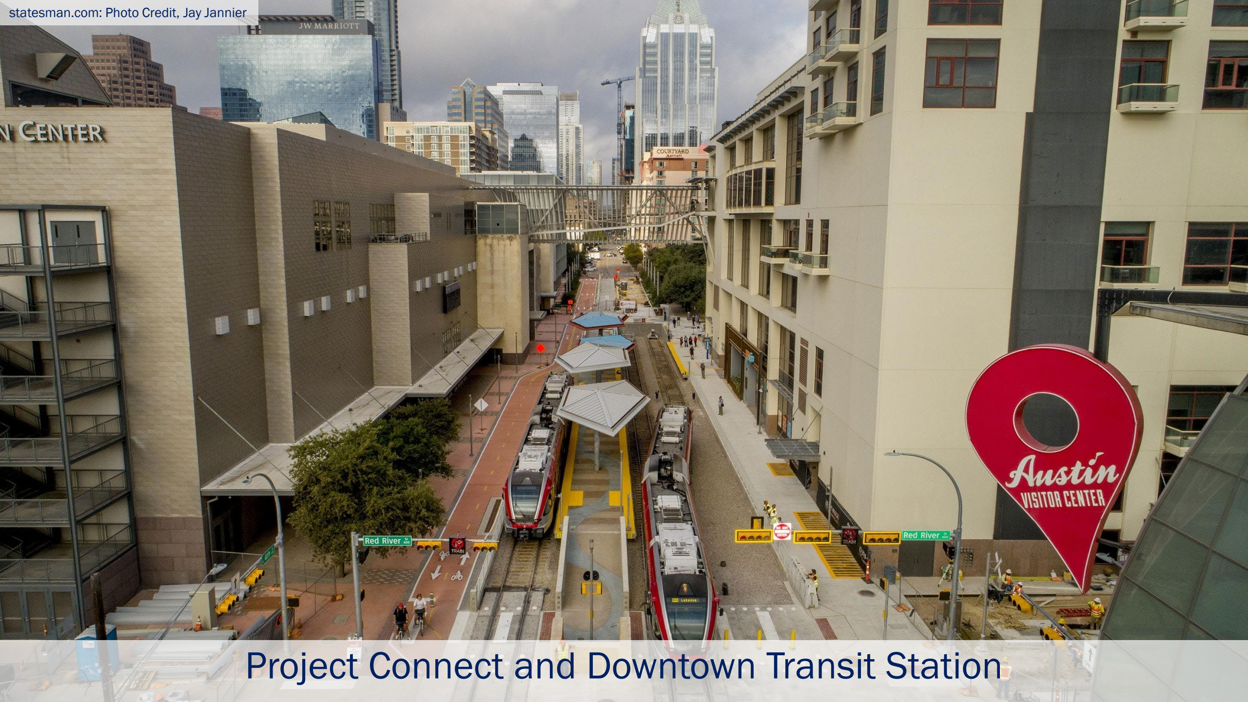
Project Connect and Downtown Transit Station