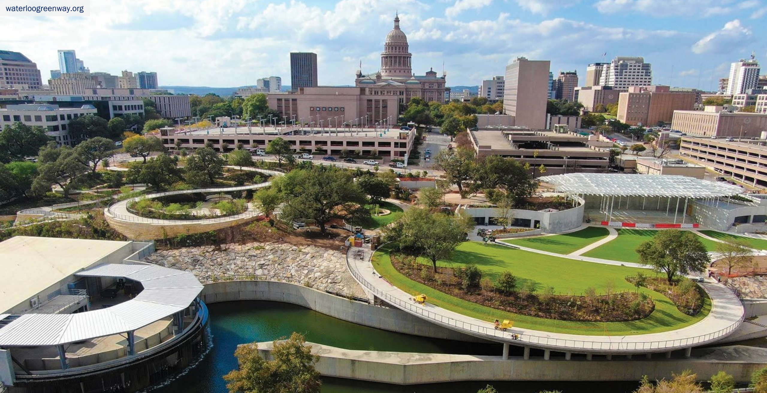
Waterloo Greenway/Waterloo Park