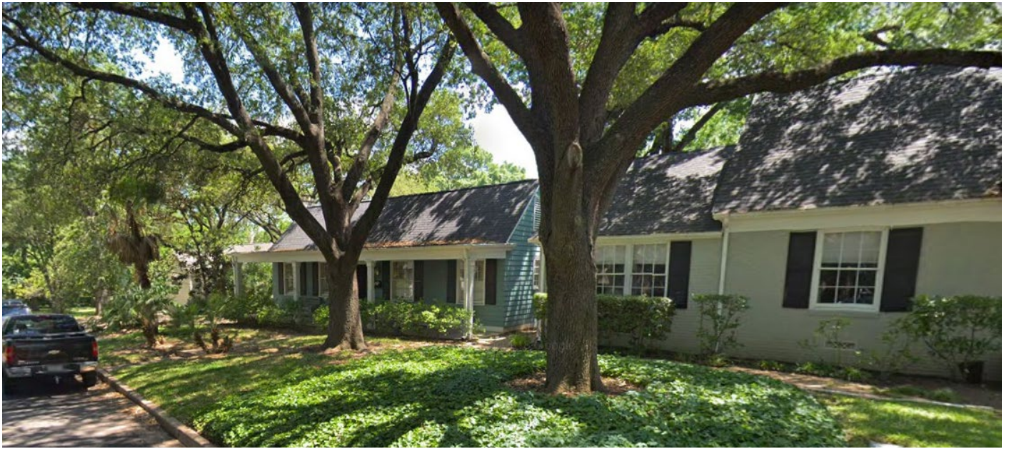
Google Street View, 2019