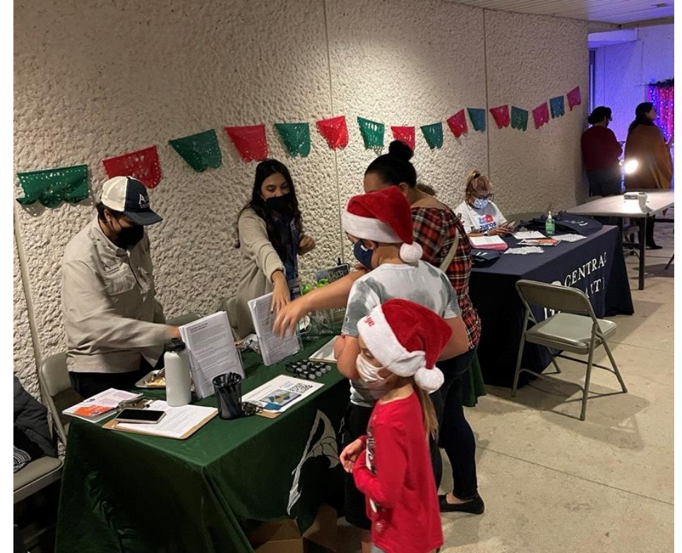
Zilker Park Vision Plan Pop-up at ESB-MACC, Dec. 15, 2021