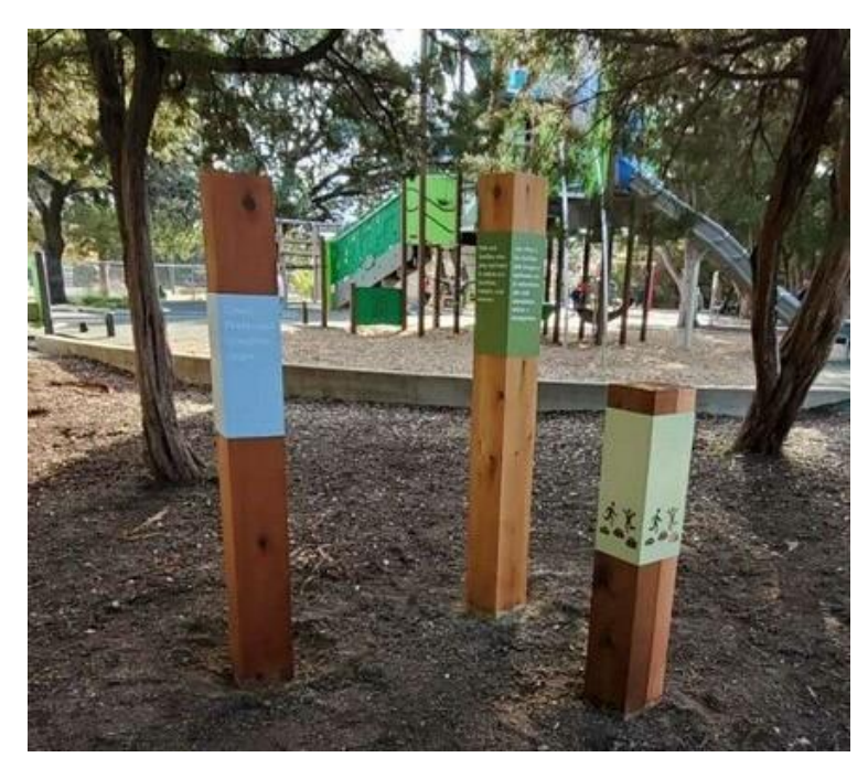
New signs installed at Walnut Creek Metro Park

Walnut Creek Metropolitan Park: Signage was installed at the nature play spaces at Walnut Creek Metro Park to help educate the public about the activities permitted in the area. As a pilot, these signs will be assessed to determine if they are appropriate for all future nature play spaces. District 4