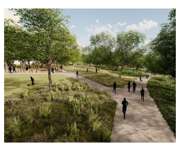
Proposed view from Existing Trailhead