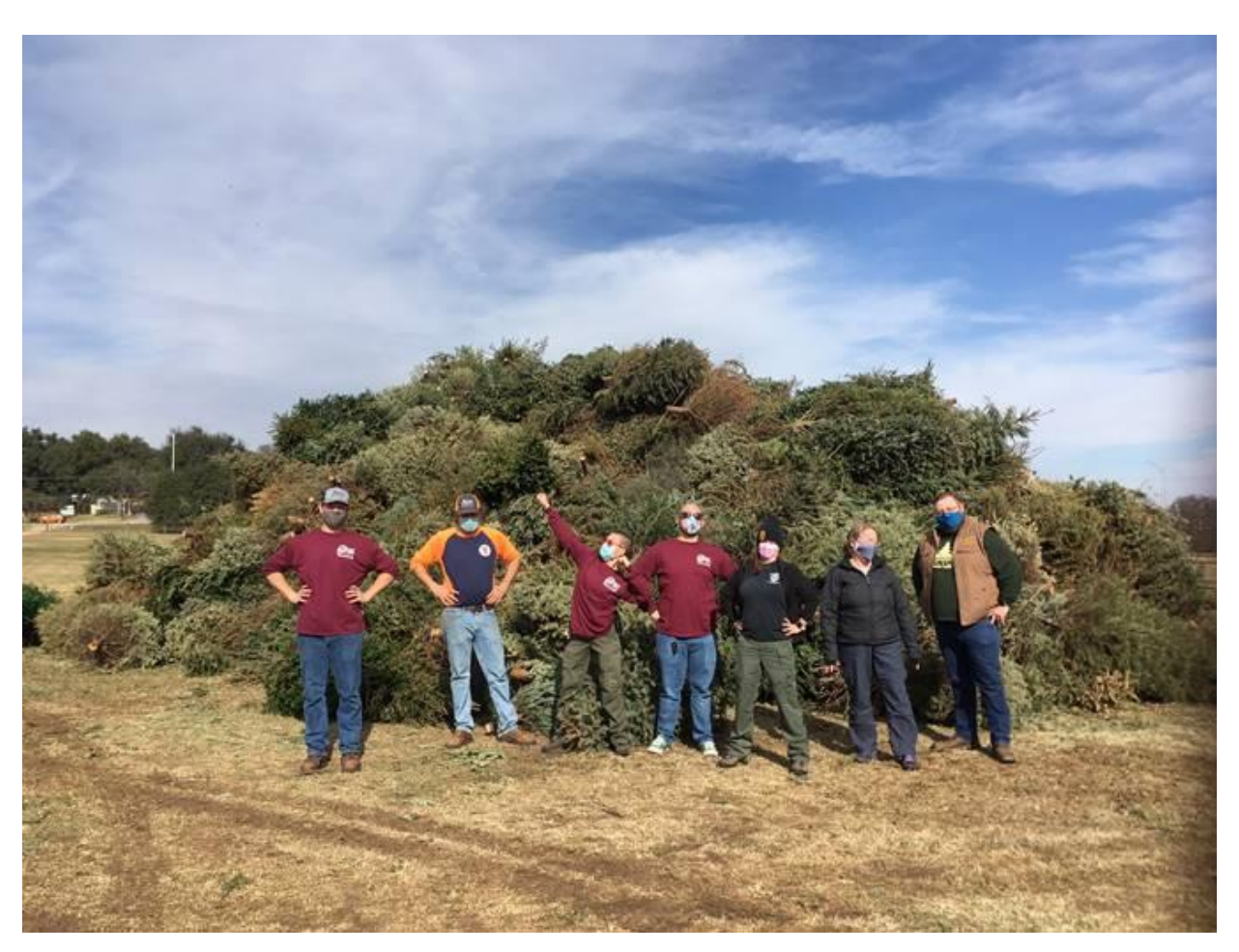
Volunteers and staff collected thousands of trees over three days

Holiday Tree Recycling at Zilker Metropolitan Park: The Parks and Recreation Department (PARD) and Austin Resource Recovery partnered again for the 35<sup>th</sup> year of Christmas and holiday tree recycling to give trees another life through mulching. All Austin residents were invited to drop trees and wreaths free of tinsel and decorations on January 2, January 9, and January 10. Contactless drop off was encouraged and all staff and City volunteers wore masks to ensure safety during COVID Stage 5. An estimated 2,000 trees were collected, and mulch was offered free to the public on January 13 in the same location. Twenty trees were also given directly to Central Texas Pig Rescue. They attest their pigs love Christmas trees for both food and entertainment.